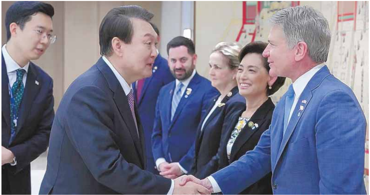
ROK President Yoon welcomes Foreign Affairs Chairman McCaul and other members of the U.S. Congressional delegation visiting South Korea earlier this month.