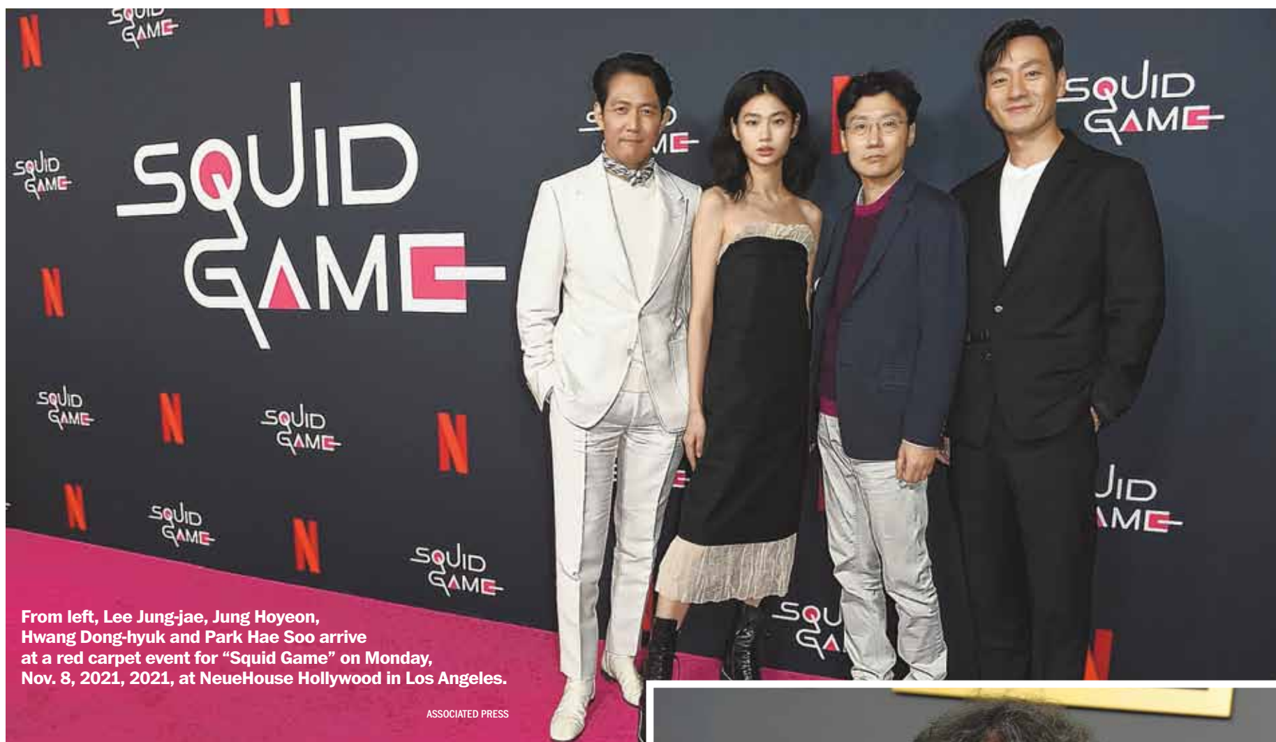
From left, Lee Jung-jae, Jung Hyeon, Hwang Dong-hyuk and Park Hae-soo arrive at a red carpet event for “Squid Game” on Monday, Nov. 8, 2021, at NeueHouse Hollywood in Los Angeles.