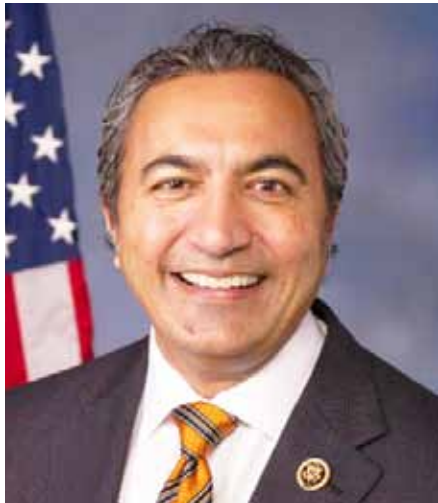
By U.S. Rep. Ami Bera, M.D.

Earlier this month, I had the pleasure of traveling to South Korea with my House Foreign Affairs Committee colleagues. On April 27, I will have the honor of welcoming President Yoon Suk Yeol as he addresses a joint meeting of Congress during his visit to the United States. President Yoon's visit commemorates the 70th anniversary of the alliance between the United States and the Republic of Korea (ROK, as South Korea is officially known)—an alliance based on mutual security and economic interests, as well as dedication to the rule of law, human rights, and democracy.