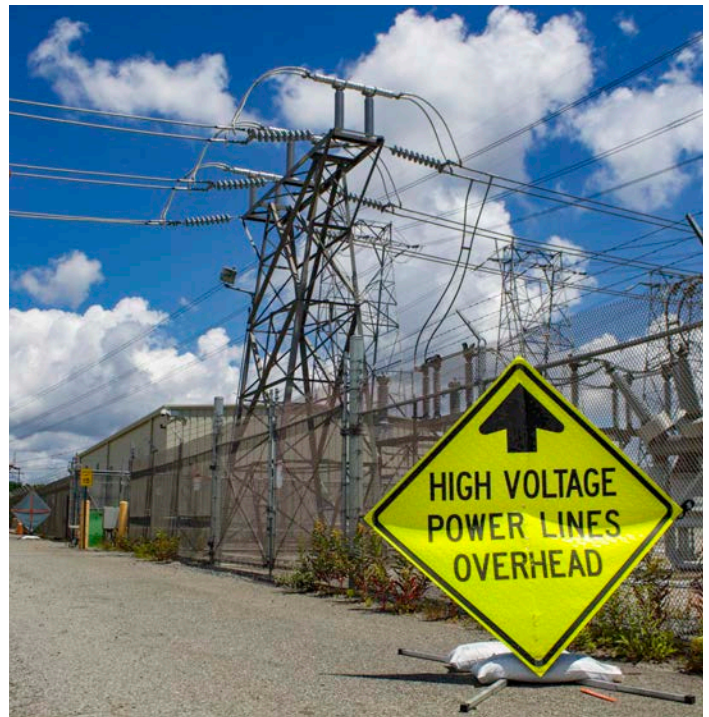
Electricity from Mayflower Wind’s offshore wind farm will be “stepped up” in voltage at the Brayton Point substation so that it can travel through the big overhead power lines more efficiently.