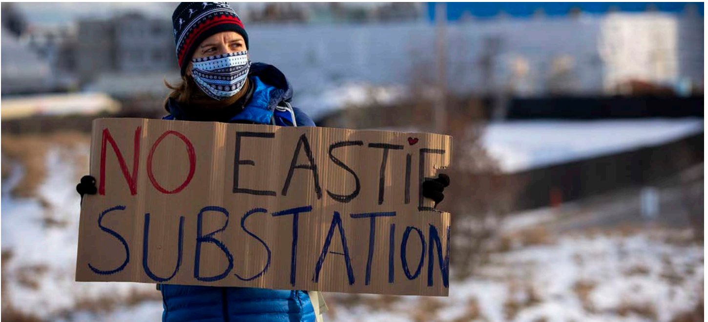
A woman carries a “No Eastie Substation” sign at a protest against the proposed East Boston electrical substation. The proposed site is behind her.