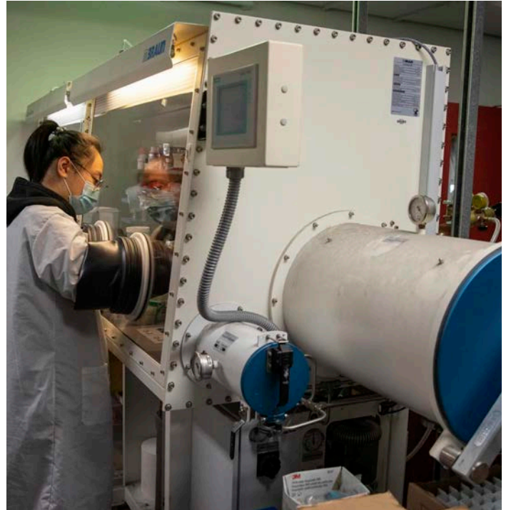
An employee assembles coin batteries in a low oxygen work bench at WPI.