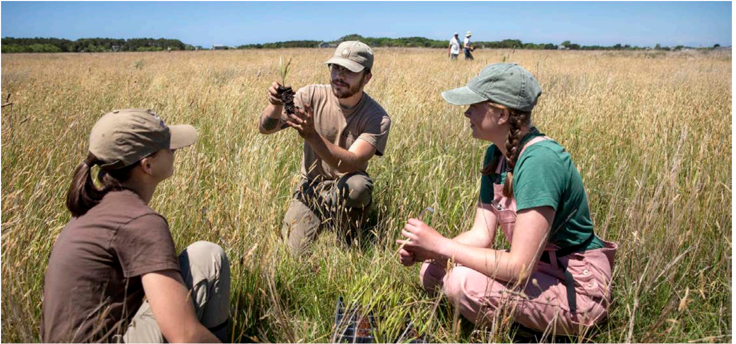
Volunteers plant seedlings from a tray of blazing star plants on the sandplain grasslands at Bamford Preserve.