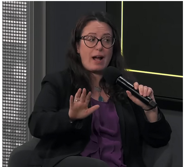
From left to right: Andre Dubus III and Matthew Desmond on American poverty; journalist Maggie Haberman.