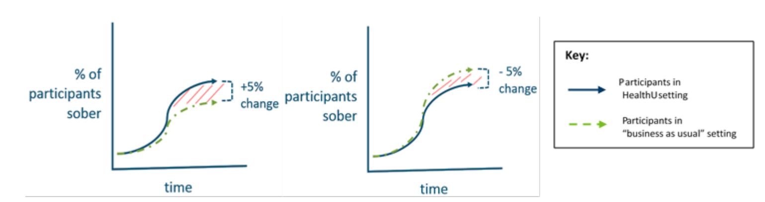
Figure 2 and 3: HealthU impact on sobriety compared to business-as-usual

Tracking both the people who participated in HealthU and those who participated in business-as-usual changes how we think about the program's success. Figure 2 shows the impact on sobriety is smaller, though still positive. Figure 3, however, shows participants would have been better off without HealthU. In this way, an impact evaluation helps us understand a program's actual effects on outcomes of interest. This information can be used by policymakers to improve the quality of Minnesota's offerings.