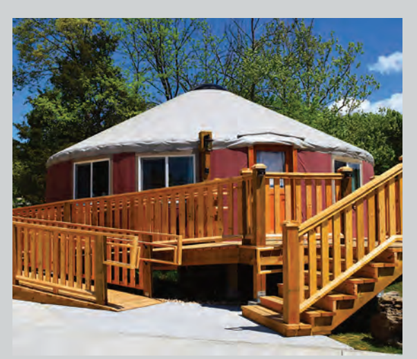
Table Rock State Park

Enroll in the Customer Rewards Program at a Missouri State Parks location or when speaking with the call center team, or update your online customer account at icampmo.com and visit mostateparks.com for more information