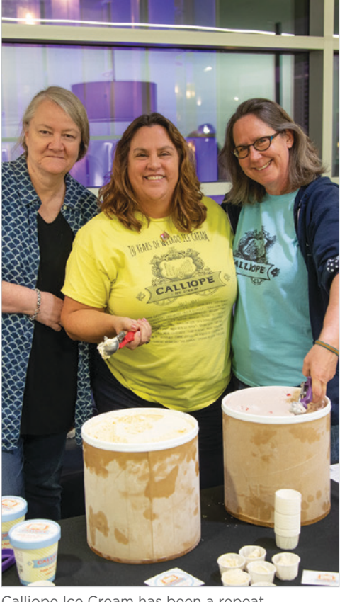
Calliope Ice Cream has been a repeat Ex Libris dessert vendor.

Tickets will go on sale at mplfoundation.org in early September. Watch for more information in our fall newsletter and on the foundation website.