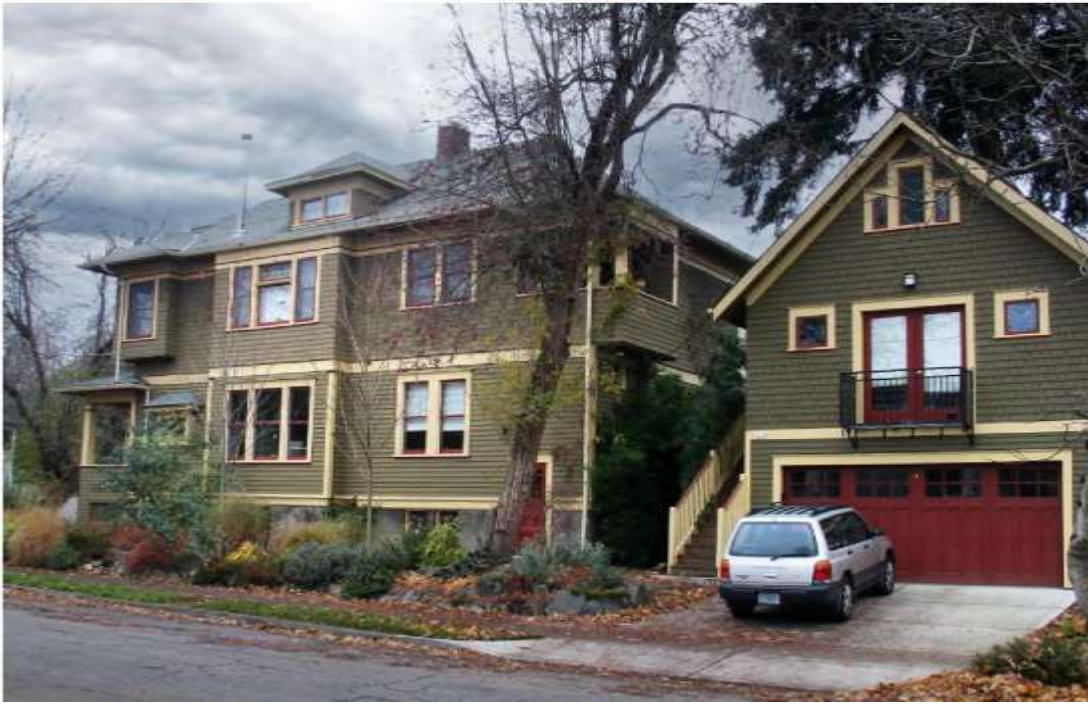
Detached ADU/"Carriage House" in Portland.