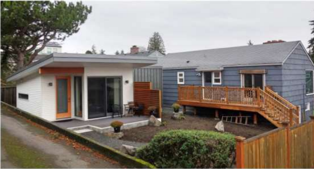
ADU in the Wedgewood neighborhood of Seattle. Credit: Pam MacRae, Sightline Institute . Used with permission.