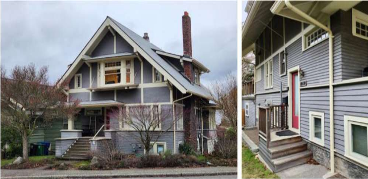
Basement attached ADU example, with attached ADU entrance on the side of the structure.