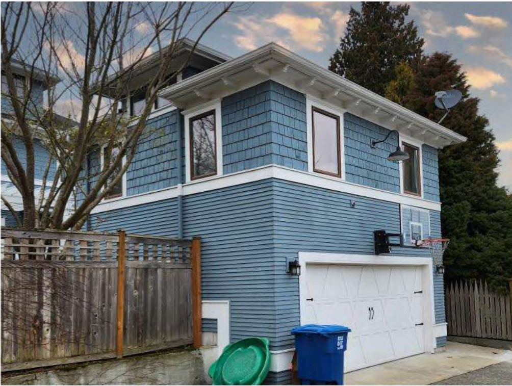
Detached ADU over a garage with relaxed rear setback. Credit: Steve Butler.