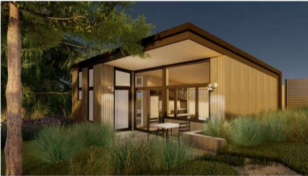
Cedar Cottage Seattle ADU Pre-Approved Plan (above and below). Credit: CAST architecture.