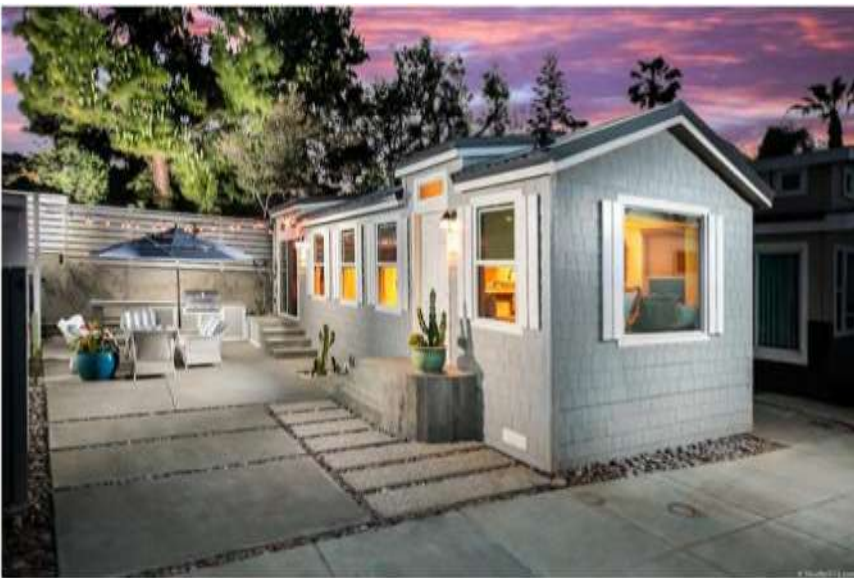
Prefab detached ADU: Nanny Flat, Elder Cottage.