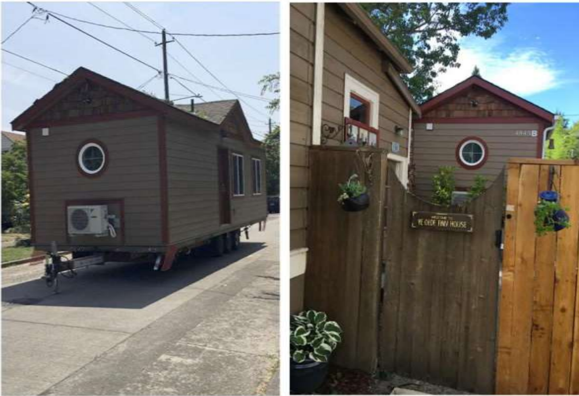
Prefab ADU travelling from factory to residential site / installed on-site.

One exception in state law is that tiny homes on wheels and RVs may be used as permanent living quarters only when situated in manufactured/mobile home communities, but they are still subject to certain life/safety and utility hookup requirements per RCW 35.21.684 . Tiny houses must be inspected and meet the standards of the Washington State Department of Labor and Industry. 42