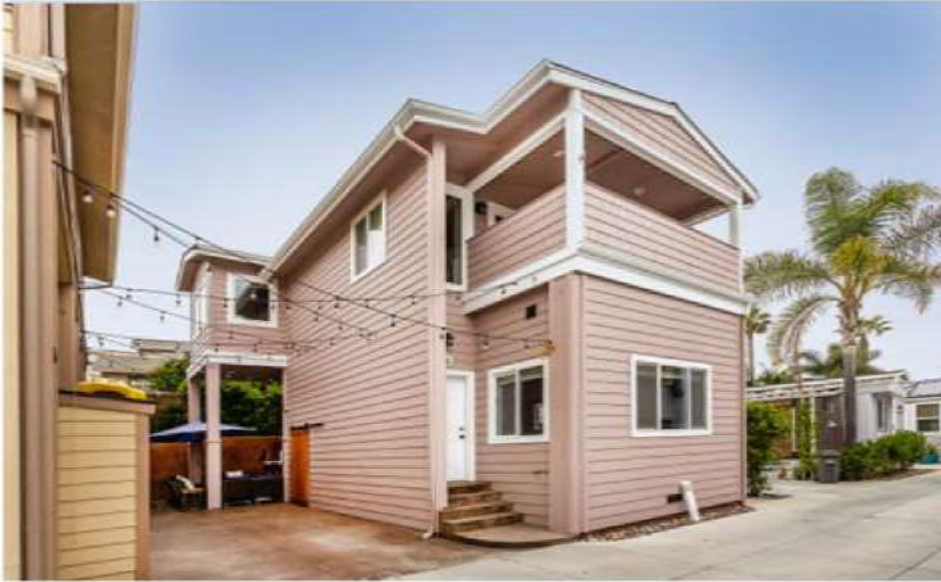
Larger, taller detached ADU – 1130 SF.