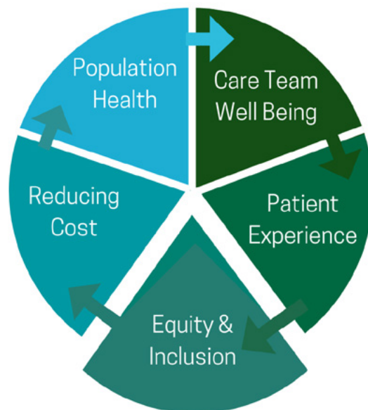
FIGURE S-1 | Advancing to the Quintuple Aim

Prioritizing equity and inclusion should be a clearly stated goal when developing and deploying AI in health care. There are many high-profile examples of biased AI tools that have damaged the public's trust in these systems. It is judicious for developers and implementers to evaluate the suitability of the data used to develop AI tools and unpack the underlying biases in the data, to consider how the tool should be deployed, and to question whether various deployment environments could adversely impact equity and inclusivity. There are widely recognized inequities in health outcomes due to the variety of social determinants of health and perverse incentives in the existing health care system. Unfortunately, consumer-facing technologies have often worsened historical inequities in other fields and are at risk of doing so in health care as well.