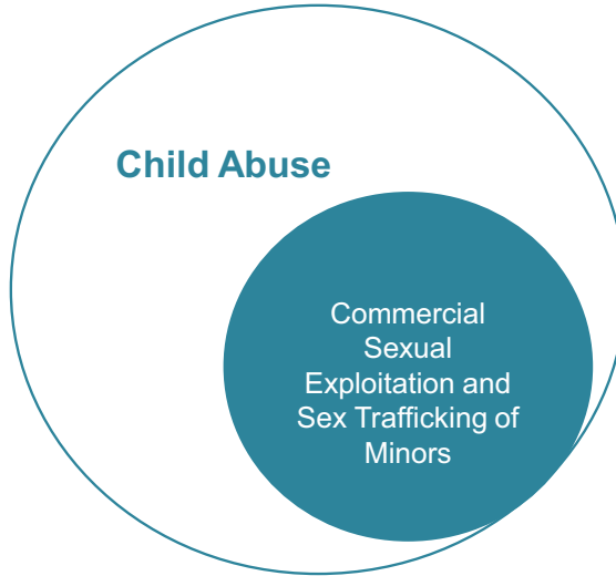
FIGURE 1 Commercial sexual exploitation and sex trafficking of minors are forms of child abuse.

NOTE: This diagram is for illustrative purposes only; it does not indicate or imply percentages.