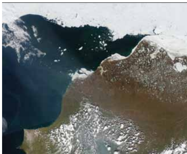
Figure 1. Understanding sea ice processes in the Arctic environment is important for predicting how spilled oil may behave, and for understanding the limitations to response efforts in an ice covered environment. This satellite image from June 25, 2005 shows almost complete ice clearing in the Chukchi Sea. In contrast, the Beaufort Sea to the east of Barrow (the most northerly point of land in the image) is still choked with very close pack ice.

High-quality bathymetry, nautical charting, and shoreline mapping data are needed for managing marine