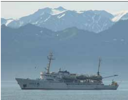
Figure 2. The NOAA Ship Rainier, which operates off the U.S. Pacific Coast and in Alaskan coastal waters, is designed and outfitted primarily for conducting hydrographic surveys in support of nautical charting.

A community-based, multiuse observing network in the Arctic that provides a wide range of long-term, accessible benchmark information could bring these disparate data together in an integrated fashion to support oil spill response and other activities. Such a system could be a collaboration of federal, state, and tribal governments, non-governmental organizations, and maritime and oil and gas industries and could be organized by the Interagency Arctic Research Policy Committee (IARPC).