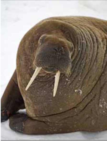
Figure 4. A walrus on the ice in the Arctic Ocean north of western Russia.