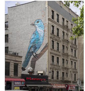
Pinyon Jay