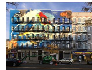
Endangered Harlem by Gaia

🐦 Mural is only visible after business hours. (It's on a roll-down gate.)