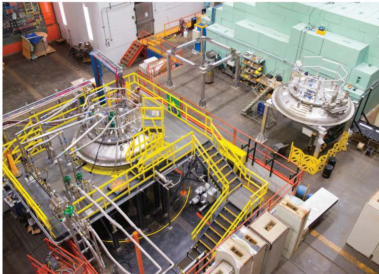
The Heavy Assembling Building at IARC offers our partners 42,000 square feet of experimental area with state-of-the-art infrastructure.