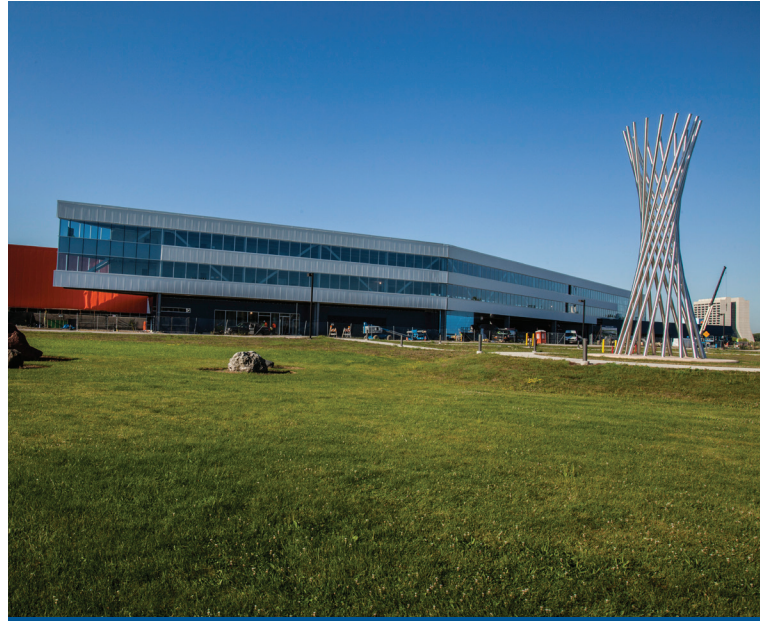
The Illinois Accelerator Research Center at Fermilab provides office space and offers a total of 89,000 square feet of space for industrial partners, with access to leading experts at the lab.