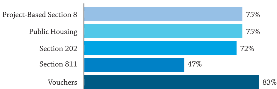
chart 1 | PERCENTAGE OF FEMALE-HEADED HOUSEHOLDS BY HOUSING PROGRAM