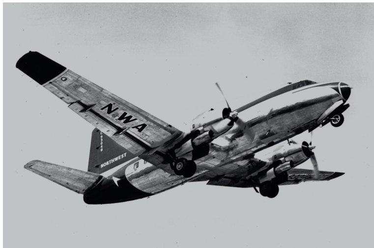
One of the M-202 fleet at the time of this story. N93048 taking off, airport unknown.