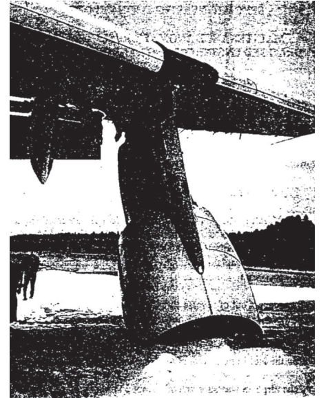
Kind of hard to ignore this one.

Incidents such as these were pointed to by the Transport Ministry to drag out treaty talks with the US over "Open Skies" liberalization of North Pacific flying rights - with the Japanese side accusing US carriers of operating unsafely and demanding the removal of fifth-freedom operations. The US side wanted complete removal of barriers such as had been achieved with the Netherlands. In the end, full Open Skies were agreed to in phases, but Japan still got what it wanted with Haneda slot restrictions.