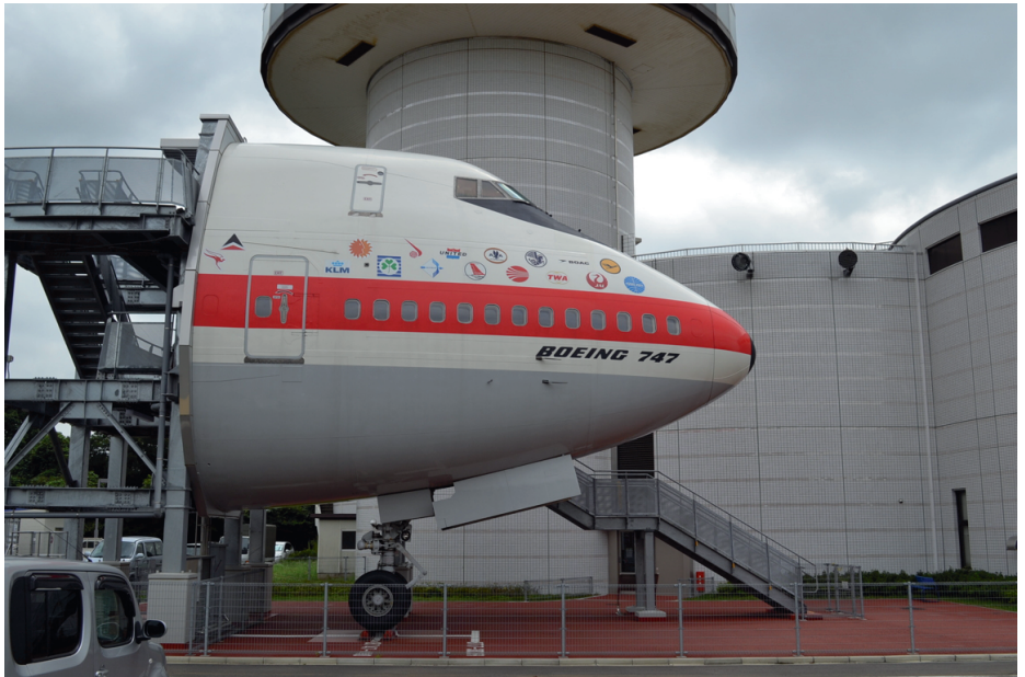
Above: the nose of N642NW.

From Terminal 1, there are five Airport Museum shuttle buses each day; also JR buses leave every 1-2 hours.