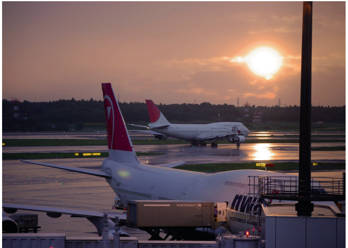
The Japanese sun sets on two iconic competitive 747-400s as they prepare for evening departures eastward across the Pacific in this image by Flickr user Hitachiota (CC 2.0 license). The 744's range, capabilities, and limitations made Narita the essential hub airport - and its replacements assured NRT's loss of dominance in Transpacific flying.

To show how the legacy of NWA carries on into the future.