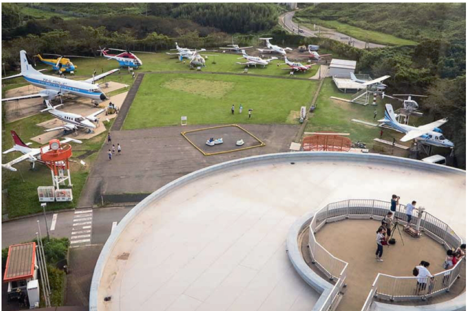
Below: museum-supplied photos via JapanVisitor.com