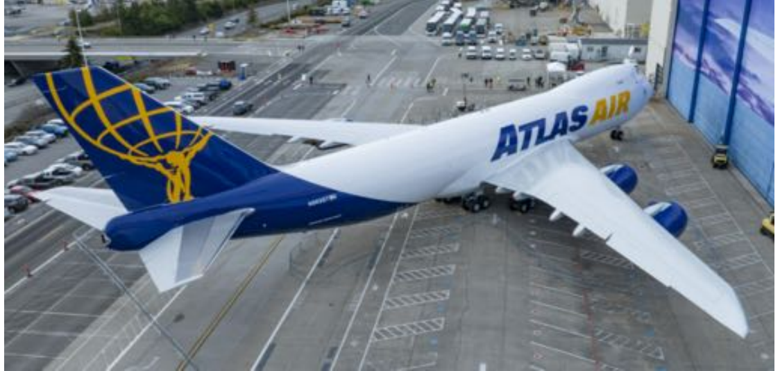
N863GT parked at Everett before the January 31 handover ceremonies. The port side of this aircraft features the Apex Logistics freight forwarder insignia, for whom Atlas will be flying this aircraft.

To inspire youth to pursue aviation careers and interests.