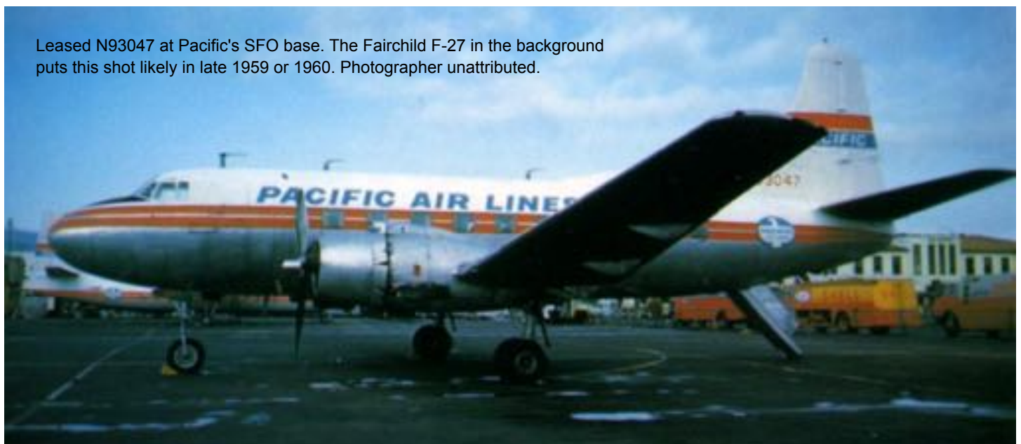
Leased N93047 at Pacific's SFO base. The Fairchild F-27 in the background puts this shot likely in late 1959 or 1960.

Dad's take on the competition between Convair and Martin to produce the "DC-3 replacement" was that Martin lost the race by introducing their product first. The Martin had many unproven innovations, and one was extensive use of 7075 grade aluminum in place of 2024 grade. It turned out (or so Dad said) that while 7075 was "stronger," it was also more brittle and thus more prone to cracking, and it didn't have the same level of resistance to corrosion. He claimed a mechanic at SFO put his foot through the corroded wing skin of a Martin (though he didn't say when, or how long the plane had been in service).