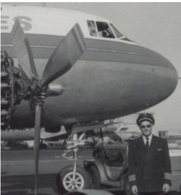
Douglass family photo, via Pacific Airlines Portfolio.