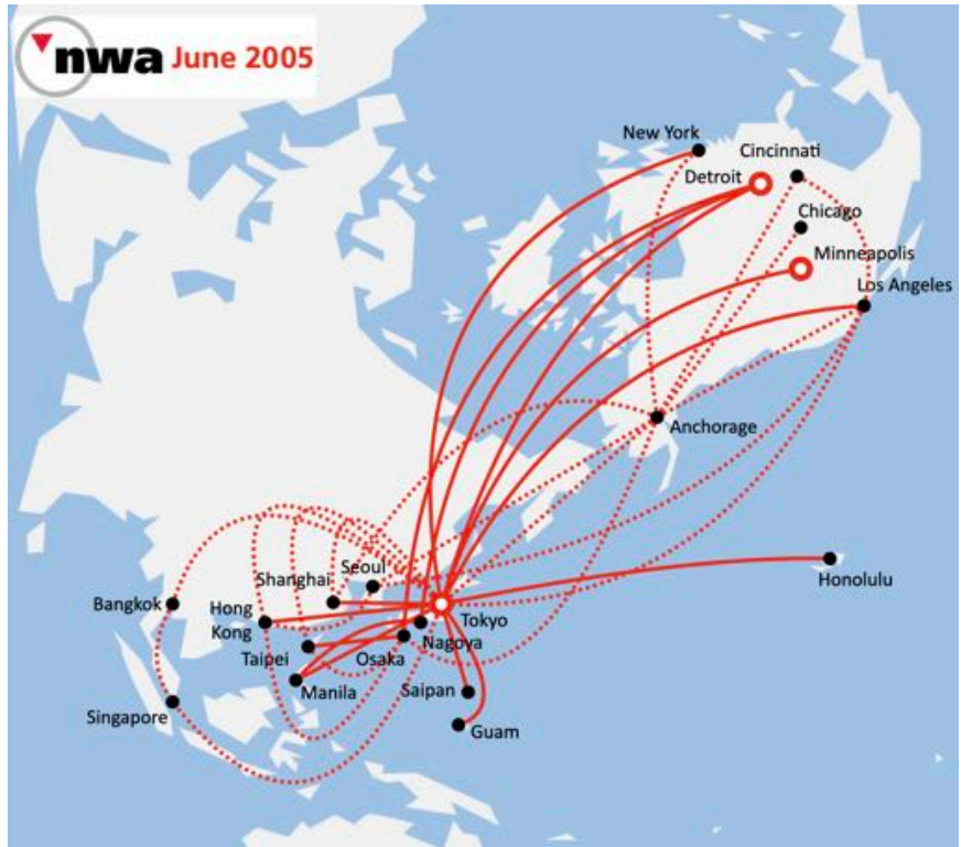
As Airbus A330s came on stream, not only were the DC-10s replaced but many 747 segments as well, with NRT/DTW the remaining core stations. The Cargo -200Fs would be retired after bankruptcy.