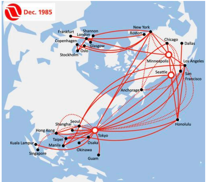
Northwest's European services were opened with the 747 before transitioning to DC-10s. The better performance of the -200 series allowed for more nonstops across the Pacific, and many prestige routes were opened.