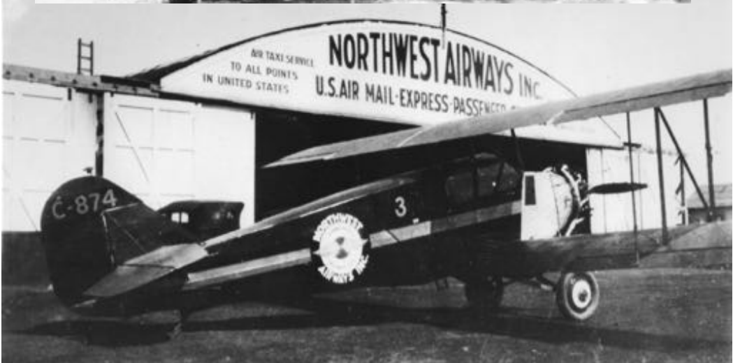
ILLUSTRATION 5: Detroit with the passenger-era logo.