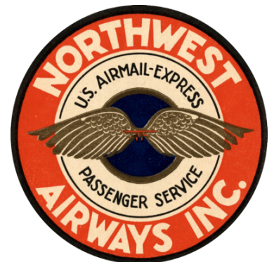
ILLUSTRATION 6: The "first" logo from passenger service in 1927.