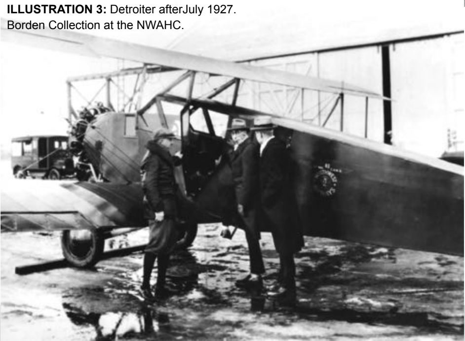
ILLUSTRATION 3: Detroit after July 1927.