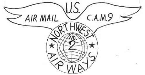
ILLUSTRATION 4: Author's illustration of the pre-passenger 1926 logo. Each aircraft had its own fleet number at the center of the insignia.