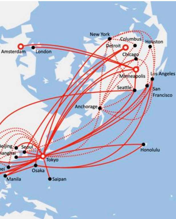
With its long-range wings with the 747-400, while Cargo (dashed lines) kept the fleet full and busy. The Cargo -200Fs would be retired after bankruptcy.