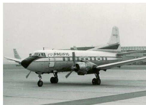
Martin 404 N40342 in the late 1950s scheme at Los Angeles