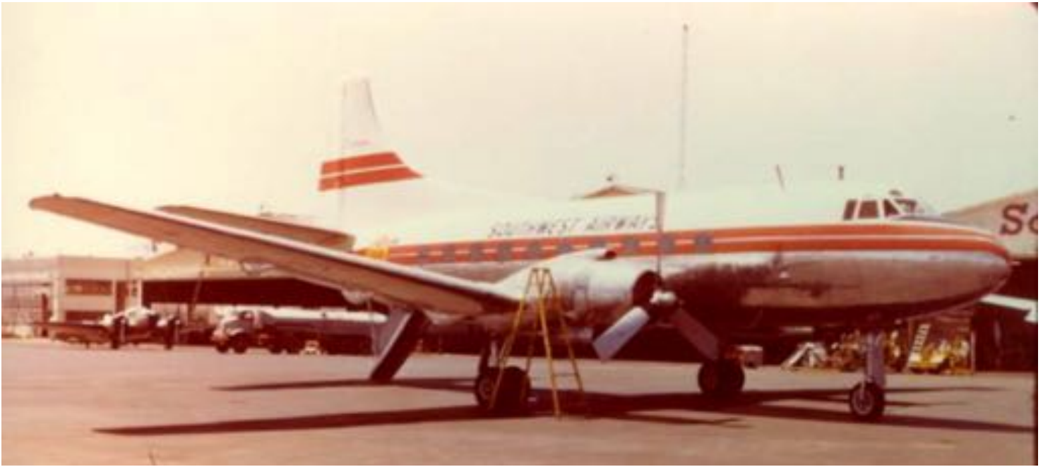
of a Martin 202 at San Francisco. Southwest brought on its first 202s in 1952 and the last left the Pacific system in 1964.