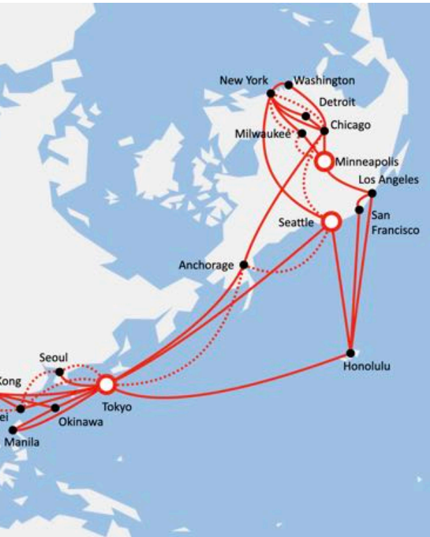
747s had replaced long-range 707 sectors and the cargo (dashed lines) gave NWA high volume at solid profit on the flight corridor of its time.

See more years' service maps on our blog!