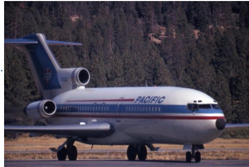
Boeing 727-100 N2969G at Lake Tahoe, September 1966