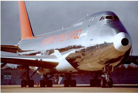
NWA publicity shot of N616US.

It took the "new" Asian carriers and their booming demand, and unconventional users like Braniff and their "Great Pumpkin" service between Dallas and Honolulu, to unlock the unique lift and range potential of the 747. Northwest - while initially swapping out 747s for 707s across the Pacific, and performing short hops to places like Milwaukee - was also early to learn how to use the Queen's capabilities and obtain new route authorities to fly it most effectively.