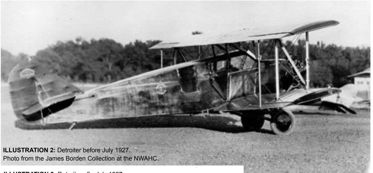
ILLUSTRATION 2: Detroit before July 1927.