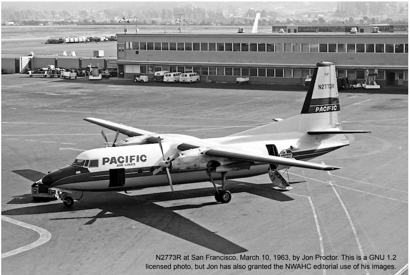
N2773R at San Francisco, March 10, 1963, This is a GNU 1.2 licensed photo, but Jon has also granted the NWAHC editorial use of his images.