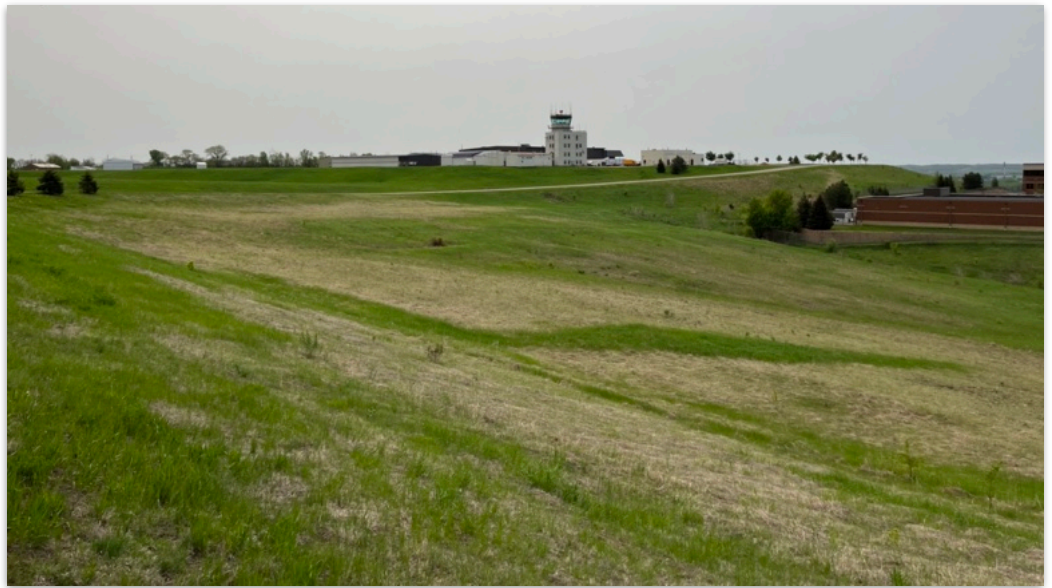
ABOVE: Looking east toward the current tower, which will be replaced with a taller structure toward the left side of the photo. BELOW: Looking west. Townhouses are sited just beyond the office park in center-shot. The river valley stretches across the center of both photos.