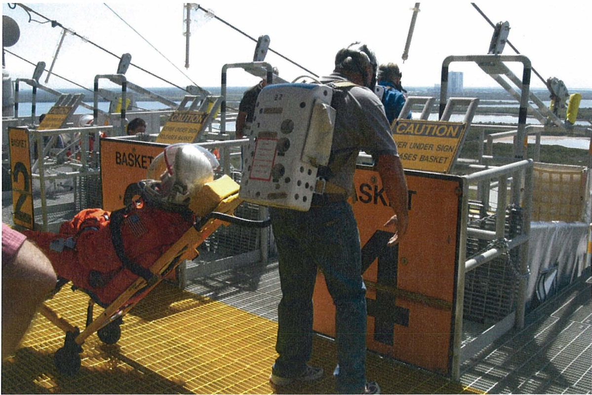
Figure 3: Rescue Chair Entry into Slidewire Basket for Shuttle Program.