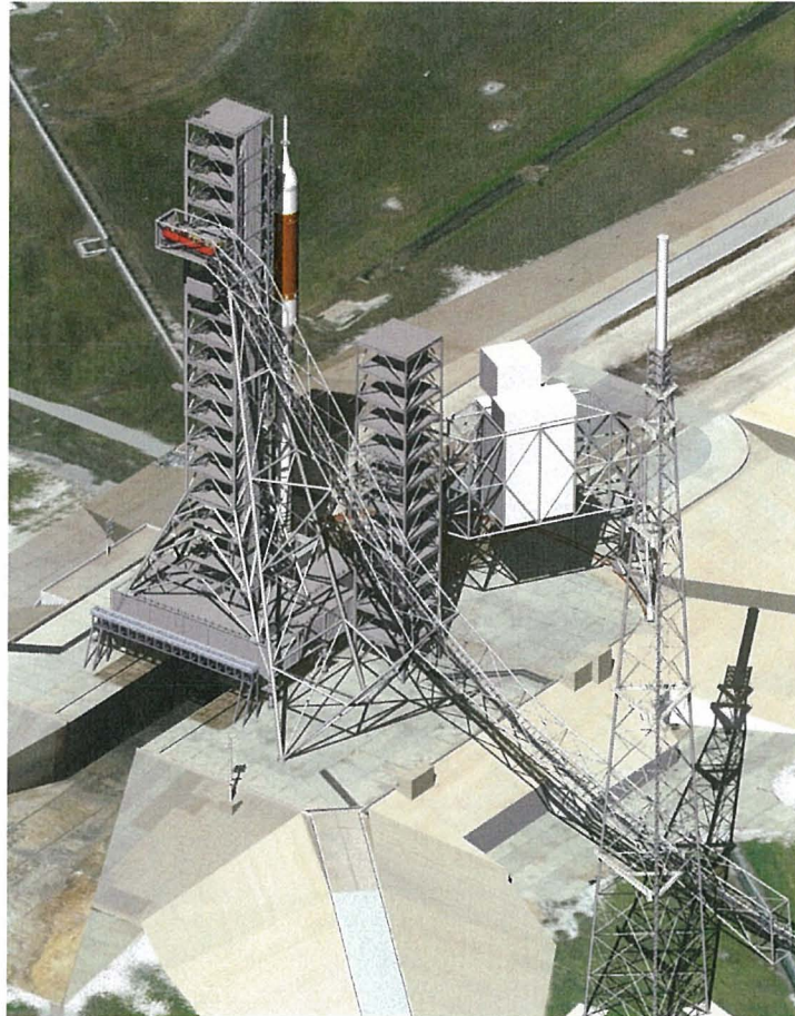
Figure 2: Constellation Program Rail EES, Conceptual Image

forces on the people riding the cars with a passive electromagnetic braking system. There was even an option to extend the rails to an area outside the BDA directly into a triage site. For this system NASA relied on many different areas of expertise: Safety, Medical, Operations Personnel, and the Astronaut Office. This helped to meet all of the customer's design requirements.