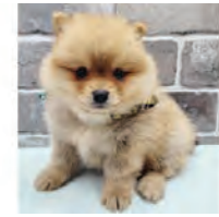
POMERANIAN PUPPIES Adorable males and females, toy or teacup sizes, shots and papers. Call 718-306-4136