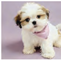
SHIH-TZU PUPPIES Beautiful Males & Females Price to Sell Call 718-306-4136