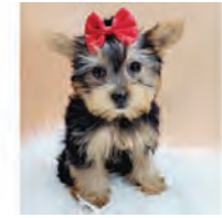
YORKIE PUPPIES ADORABLE, pure breed, toy & teacup sizes. Call 718-306-4136