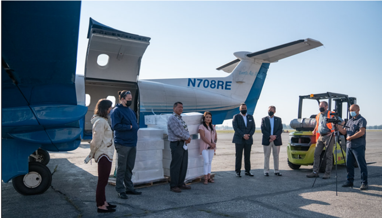
The Dunleavy Administration, including Lt. Governor Meyer, and Tanana Chiefs Conference, are pictured at Fairbanks International Airport as salmon are distributed to Interior Alaska communities along the Yukon River

Strong partnerships and collaboration between local businesses, tribal and village leaders, seafood processors, and shipping companies all played an integral role in the success of this project in FY2022. In addition to the State's purchases, Governor Dunleavy's administration led efforts securing donations of 33,000 pounds of salmon for the people of the Yukon region. With all efforts totaling more than 70,000 pounds of salmon distributed to 3,284 households. The State will be looking for similar partnerships to address this need again in FY2023 as fish returns remain at historic lows and COVID-19 supply chain difficulties continue.