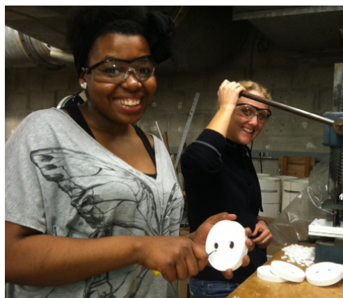
Figure 7. University of Washington (UW) technician and research student from UW Louis Stokes Alliance for Minority Participation Program fabricate rearing chambers for experiments on the response of crabs and krill to ocean acidification.