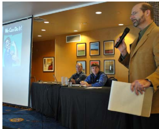
Figure 4. An education specialist at Monterey Bay Aquarium discusses communicating about ocean acidification in aquariums at the "Effective Practices for Communicating Ocean Acidification" workshop, hosted by NOAA National Marine Sanctuaries.

Each goal will be met as members of the NOAA OA education community (including collaborators) use actions outlined below to achieve the associated objectives. The actions necessary to reach the outcome for each goal will be evaluated as the NOAA OAP education and outreach programs develop and will be informed by the needs assessments completed in conjunction with this implementation plan.