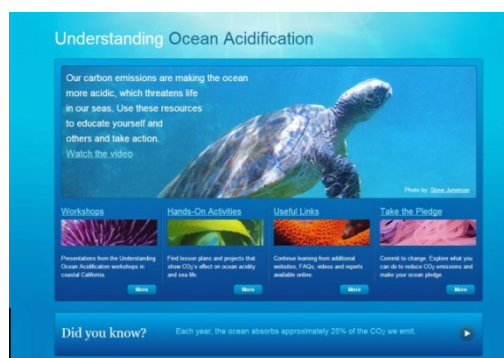
Figure 3. Channel Islands National Marine Sanctuary's Ocean Acidification web portal ( http://www.cisanctuary.org/ocean-acidification/ ).

In an effort to expand upon this regional approach, communicators and educators from across NOAA and partner organizations attended a workshop convened by the West Coast National Marine Sanctuaries in September 2012: “Effective Practices for Communicating OA.” 10 The workshop provided an in-depth discussion on how the national education and outreach community can work together and use their collective momentum to develop new ways to explain and foster understanding of this complex environmental topic. The goals of this implementation plan align with those of both the regional action plan and the Sanctuaries’ workshop outcomes, including communicating OA science directly to those who must act and focusing more broadly on developing a deeper understanding of the causes of and most innovative ways to mitigate the chemistry changes happening to our ocean.