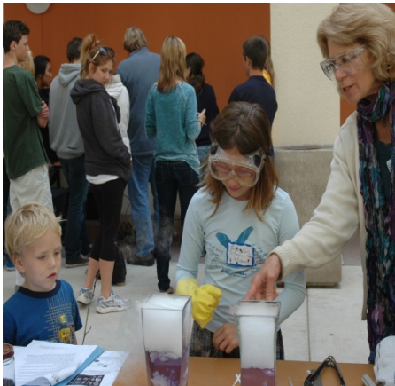
Figure 2. A young audience engaged in a hands-on ocean acidification demonstration by NOAA National Marine Sanctuaries staff at an outreach event.

Therefore, many stakeholders have decided that continued research and monitoring of OA is important to understand the chemical trends and their potential biological and ecosystem impacts. The Federal Ocean Acidification Research and Monitoring (FOARAM) Act of 2009 calls upon NOAA to have an active monitoring and research program. Additionally, the FOARAM Act calls for education and outreach to improve the public's understanding of current scientific knowledge of OA and its impacts on marine resources. In 2010, the NOAA Ocean and Great Lakes Acidification Research Plan was developed to outline focal areas for NOAA's OA efforts in the various regions of the U.S. 6 One of the six focal areas for efforts in each region is "engagement", which involves "an education and outreach program to communicate the science and ecosystem consequences of ocean acidification to the public and stakeholder communities." 7 These communities include, but are not limited to, researchers, policy makers, marine resource users, teachers and students — groups that can use NOAA science to make informed decisions and support NOAA's mission of "science, service, and stewardship" through their actions. This Implementation Plan is designed to foster a coordinated and collaborative process across a wide range of programs and activities with the following aims which are outlined in the NOAA Ocean and Great Lakes Research Plan: