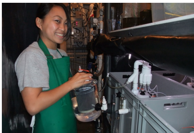
Figure 5. Hollings Scholar working in the Northwest Fisheries Science Center Ocean Acidification (OA) lab on an experiment to study the response of larval oysters to OA.

OA issues stand to impact coastal communities in ways yet to be realized and will require that NOAA continue to find new methods of empowering people to be ocean stewards. Collaboration between NOAA and its affiliates through local, state, regional, national, and international partnerships will encourage an open dialogue and present the opportunity for communities to change how complex science topics are communicated among scientists, educators, and local citizens. By encouraging innovative solutions, NOAA remains flexible in its outreach message, educational approach and partnerships to serve the immediate and future needs of OA education and outreach.