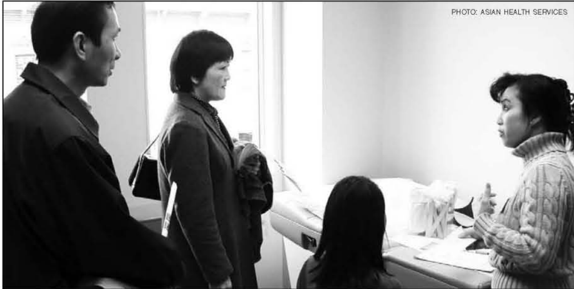
JAs have the lowest incidence of fair to poor health while newer immigrants have the highest.