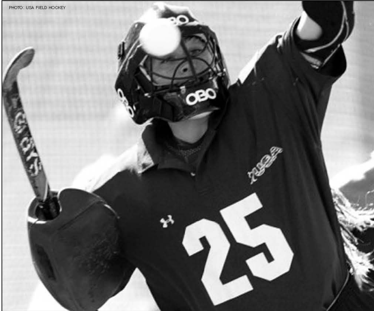
'Working as a team towards a common goal is something really special,' said the goalkeeper.