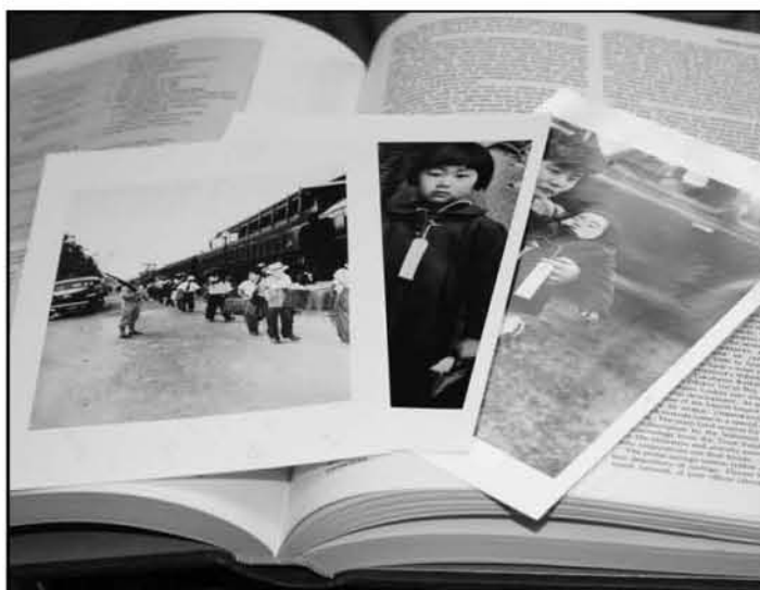
JACL officials said the curriculum standards could misrepresent the significantly different treatment of JAs during WWII.