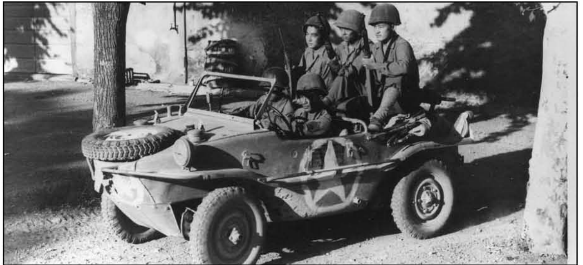
Approximately 14,000 Japanese Americans served in the 442nd RCT and 100th Battalion.