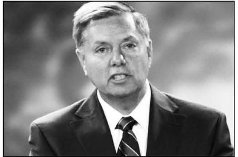
JACL denounced Sen. Lindsey Graham’s stereotypical remarks.