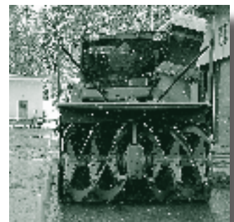
Advanced Rotary Plow