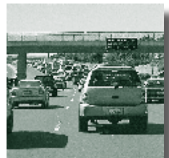
Traffic Flow Studies