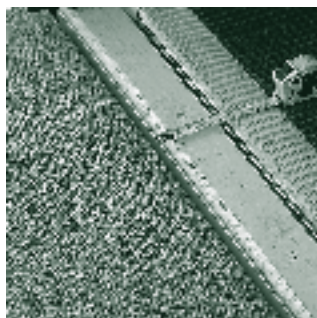
Precision Docking Provides Small Gap