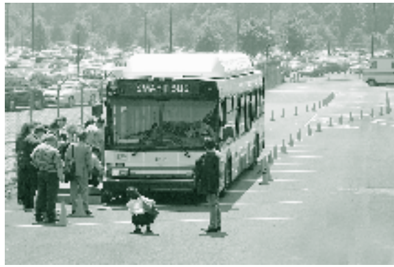
Precision Docking Bus and Course

The PATH precision-docking bus provides highly reliable and accurate performance. Several LED lights on the dashboard inform the driver about the status