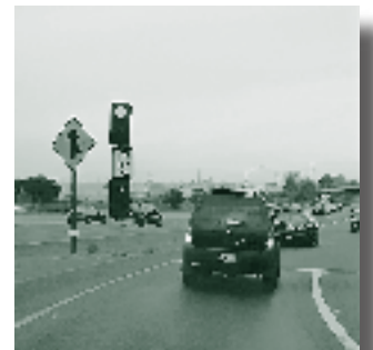
Ramp Meter Studies