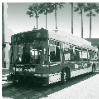
Rapid Transit in Los Angeles