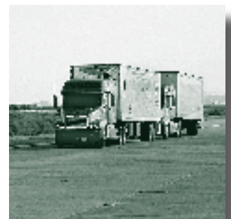
Aerodynamic Testing of Heavy Vehicles