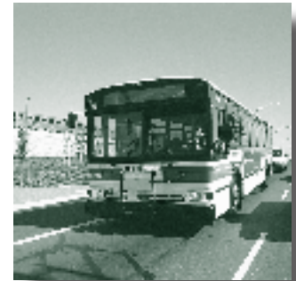
Forward Collision Warning Bus