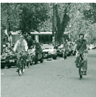
Other UC Davis Transit