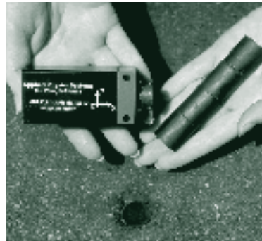
Magnetometer and Magnets for PATH's Magnetic Marker Reference System

and readiness of the bus and the docking systems. The driver can easily select between full and partial automation, and make the transition smoothly.