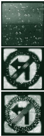
Driver Infrastructure Interface (DII) in its 3 stages

PATH'S second demonstration featured Frontal Collision Warning Systems on a San Mateo Transit bus, a project sponsored by the Federal Transit Administration (FTA). The demo showed how bus drivers can benefit from a warning system that uses radar, lidar, and computers to "watch" the operating environment and a driver-vehicle interface to warn the driver of a possible frontal collision. For several years, PATH has conducted research to understand the causes and consequences of transit frontal collisions. The knowledge gained has led to the development of a prototype collision warning system that provides the driver with an effective warning when the system determines that a potential collision may occur. Based on a well established data fusion model, a preliminary detection algorithm was developed that can track different obstacles within the sensor field of view and can decouple the bus motion from the sensor measurements. A warning algorithm was also developed to incorporate a warning threshold synthesized from the drivers' normal braking behavior. When the system determines that the distance to a vehicle or obstacle in front of the bus is closing too rapidly, it lights up two orange LED lightbars mounted on each side of the windshield. The LED elements are illuminated sequentially, giving