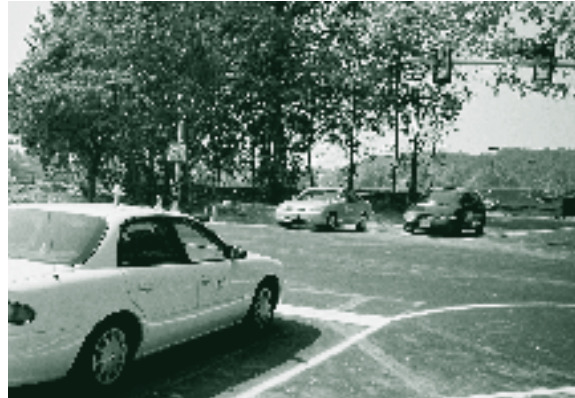
Intelligent Intersection at FHWA Turner-Fairbanks Research Center