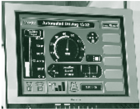
Driver Vehicle Interface (DVI)

ferred control to the automated system, he did not need to do anything else until reaching the other end of the HOV lanes, where he regained control. This capability indicated the potential for future operations without requiring a driver to be on every bus operating along a dedicated, protected bus-way. However, the technology is not yet sufficiently mature and fault-tolerant to make it possible for our drivers to leave the driver's seat (except in the limited case of the low-speed precision docking maneuver).