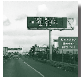
Changeable Message Sign Studies