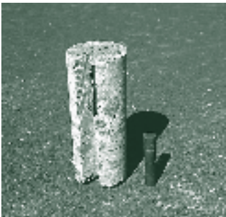
Sample of Roadway Showing Magnets