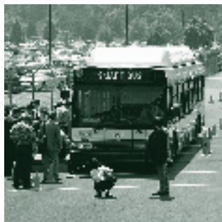
Precision Docking of Transit Vehicle