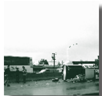
Congestion Costs of Freeway Accidents