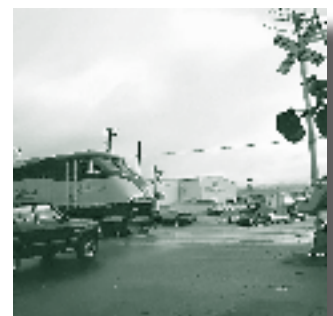
At Grade Rail Crossing