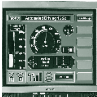
Driver Vehicle Interface