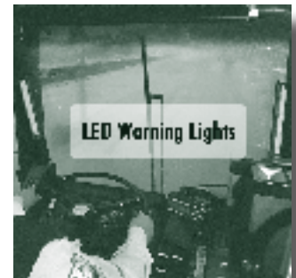
FCWS LED Warning Lights