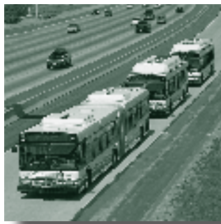
Automated Bus Rapid Transit