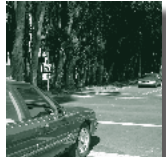
PATH Instrumented Intersection