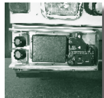
FCWS Sensors Evaluated