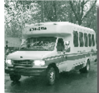
Demand Responsive Transit Vehicle