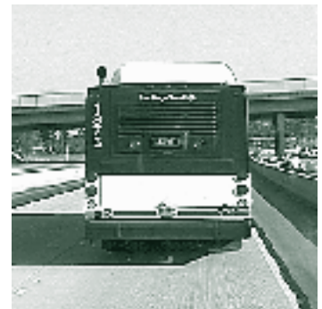
Lane Assist Demonstration

• Automatic lane-keeping (or lane assist) of the buses operating in a line-haul mode on the I-15 HOV lanes. This demonstration showed the ability of the automatic steering system to keep the bus centered accurately over the lane, while providing a smooth ride for the passengers. This is an important capability to enable buses to operate in narrow lanes where right of way is costly or unavailable. The driver was able to switch back and forth between automatic and manual steering at will, showing how a driver could override the automatic system when necessary.