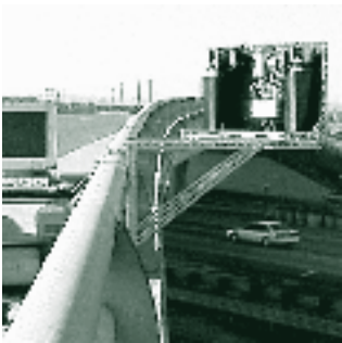
Laser Photodiode Array Vehicle Detection