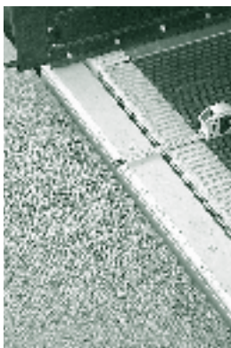
Gap Between Bus and Platform