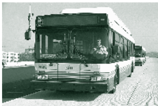
Close Following Bus Platoon Demonstration

The efforts were considerable and involved extensive time spent away from home by a team of fifteen PATH research and development engineers, working under the leadership of Dr. Ching-Yao Chan. Their work schedule was governed by the limited availability of the I-15 HOV facility for testing in preparation for the demonstration. All of the preparatory testing needed to be conducted during the four weekends prior to the demonstration (8 am to 8 pm each day) and during the weeknights in the two weeks immediately before the demonstration (8 pm to midnight). With outstanding cooperation and support from Caltrans District 11 and Division of Research and Innovation (DRI) colleagues, extremely rapid progress was made during that final month of preparations for the demonstration. ❄