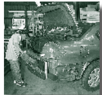
Preparing Taurus for Driver Modeling

Evaluation of Automated Work Zone Information Systems (AWIS); RTA 65A0155; Chao Chen, CCIT.