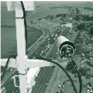
Video Camera for Berkeley Highway Lab