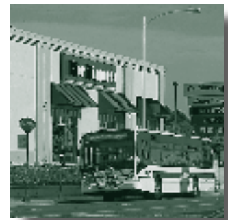
Rapid Transit San Pablo Ave Corridor