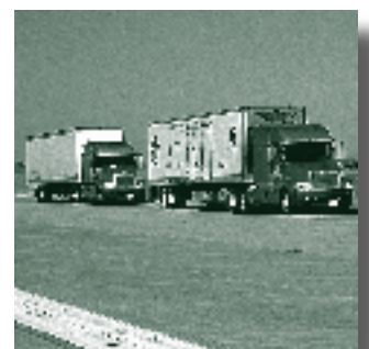
Heavy-Duty Vehicle Emission Studies