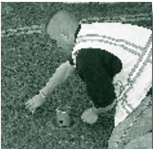
Preparing to Place Sensor