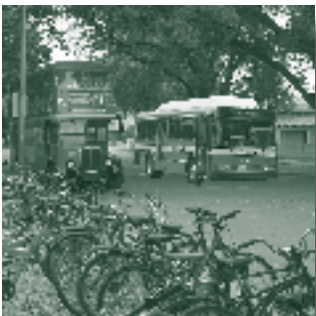
UC Davis Transit