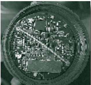
Smart Parking Sensor