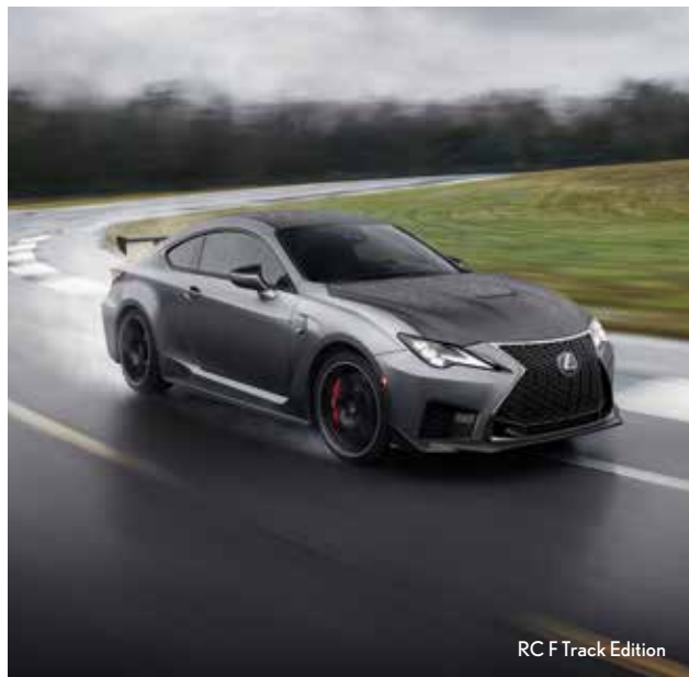
RC F Track Edition