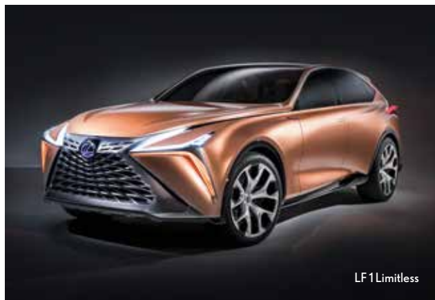
LF 1 Limitless

Lexus topped the overall brand list for the sixth year in a row