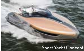
Sport Yacht Concept

LS500 named 2017 EyesOn Design Award for Design Excellence – Interior Design at the 2017 North American International Auto Show in Detroit