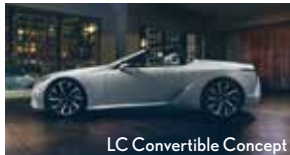
LC Convertible Concept

Kelley Blue Book awards Lexus the Best Overall Luxury Brand and Most Trusted Luxury Brand in 2019 Brand Image Awards