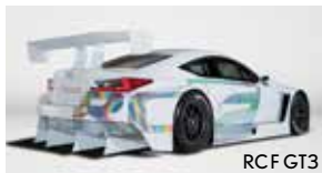
RC F GT3