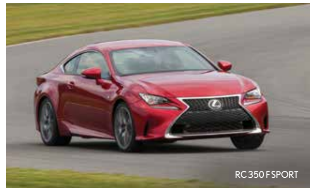
RC 350 F SPORT