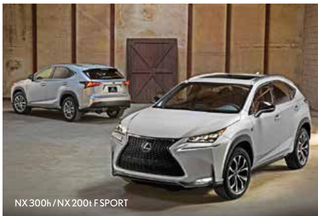
NX 300h / NX 200t F SPORT