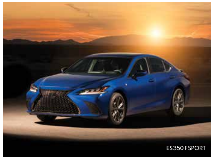
ES350 F SPORT