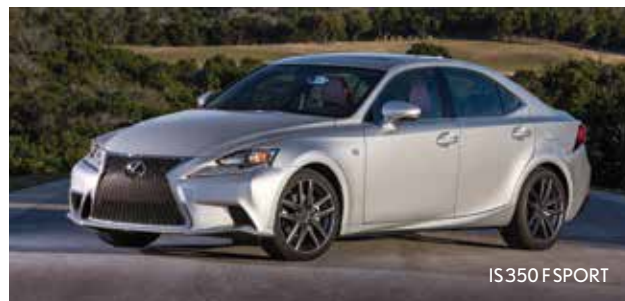
IS350 F SPORT