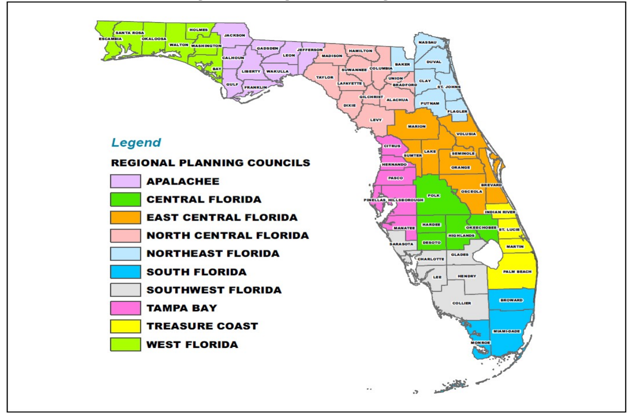
Figure 1-3. Regional Planning Councils

For more details on each criteria, please review Methodology for Recommendation of Projects for Funding attached hereto as Appendix D. Figure 1-3 below shows a map of the RPC regions across the State of Florida. The RPC regions are established to coordinate planning for economic development, growth management, emergencies, and other regional impacts.