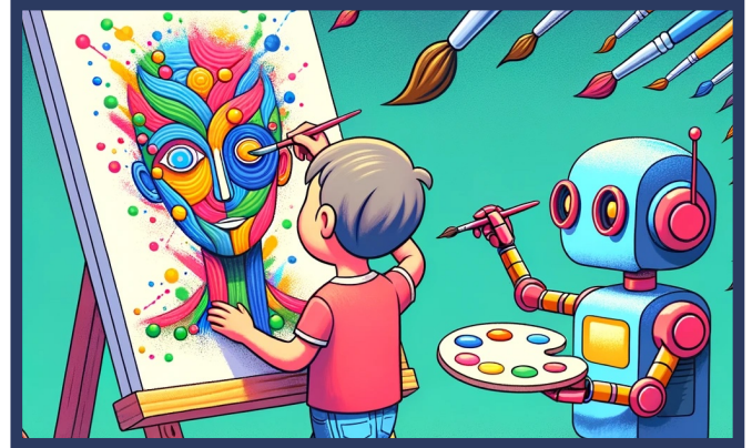
Perspectives on Psychological Science