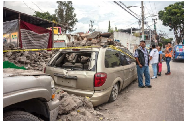
Mexico earthquake 09/19: Aftermath in Xochimilco

The World Bank has supported Mexico's CAT bond program since 2005 and issued CAT bonds covering Mexico's risk in 2017 and 2018. In 2018, the World Bank issued a $1.4 billion CAT bond for Mexico and the three other members of the Pacific Alliance (Chile, Colombia, and Peru).