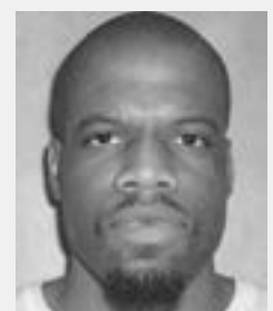
Clayton Lockett

It was only then that the execution team lifted the sheet and discovered that a vein had “exploded” or “collapsed” and “the drugs were not getting into the system like they were supposed to.” 32 The drugs had bubbled under his skin, resulting in a swelling “larger than a golf ball.” 33