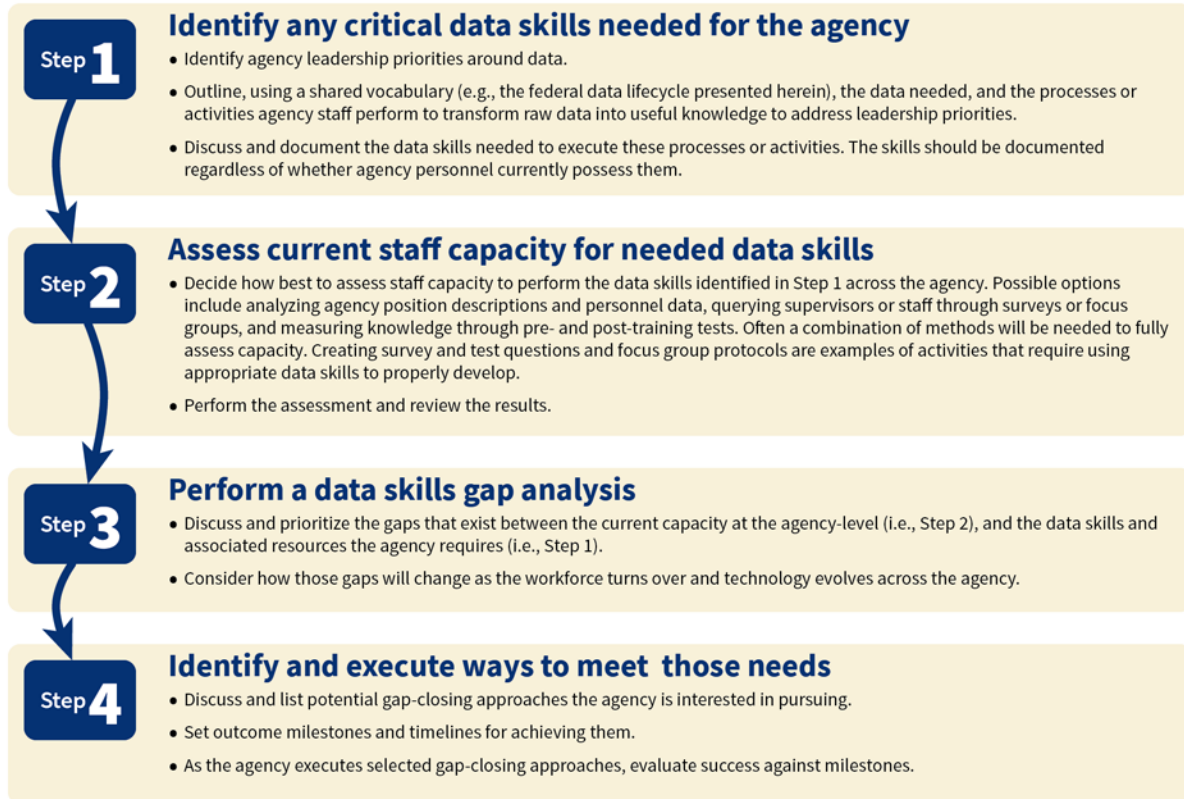
Figure 1: Process to identify opportunities to increase staff data skills