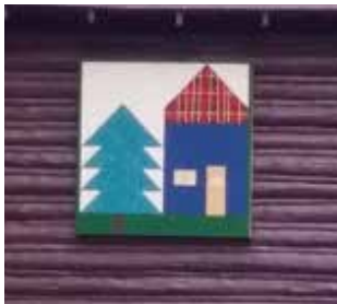
BRETHREN HERITAGE ASSOCIATION

The Brethren Heritage Association Quilt Square is a Log Cabin design, chosen because the museum itself features much of the logging industry at the turn of the 20th Century when Brethren was established and many of the settlers built log cabins too. The main museum itself is a log cabin.