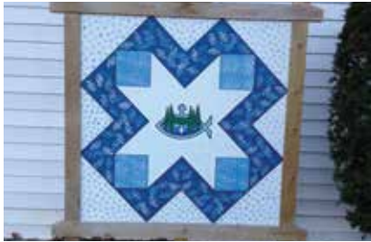
LAKEVIEW CHURCH OF THE BRETHREN

How can a quilt block have similarities to a church? Perhaps this way. One quilt block alone can be beautiful. Let it be joined by other 'blocks' and it becomes a fine quilt top. Add 'filler' and 'backing' and you have an inviting, warm comforter!