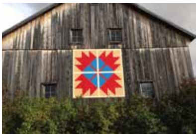
MAPLE LEAF AT MARILLA MUSEUM

The Maple Leaf pattern has been chosen because of Marilla's long tradition of producing maple syrup and the area's abundance of maple trees. The pioneering Chesboro family of Marilla Township held a family tradition of planting a maple tree for each new birth in the family. In the early years of Marilla Township, according to the 1883 agricultural census, maple syrup was described as maple molasses. The Marilla Historical Society maintains four historic buildings (on site).