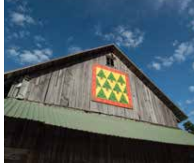
FOX FARM NURSERIES QUILT