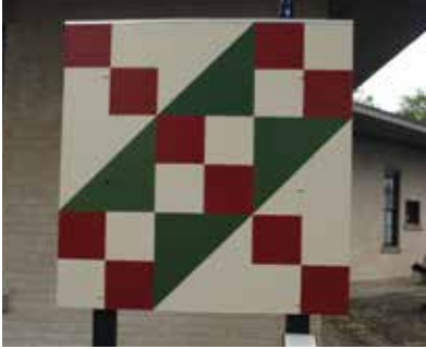
FINNISH IMMIGRANTS TRIBUTE IN KALEVA

The quilt pattern on the side the of Kaleva Depot Railroad Museum represents the tracks on which trains traveled to and from Kaleva in the late 1880s, transporting lumber from harvested white pine, and immigrants from Finland who settled the town.