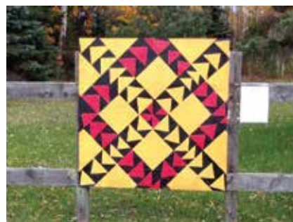
NORWALK RAILROAD CROSSING QUILT

Folks were living in Norwalk when the State Road, now called Old U.S. 31, was built through it in the 1850s. The second post office in