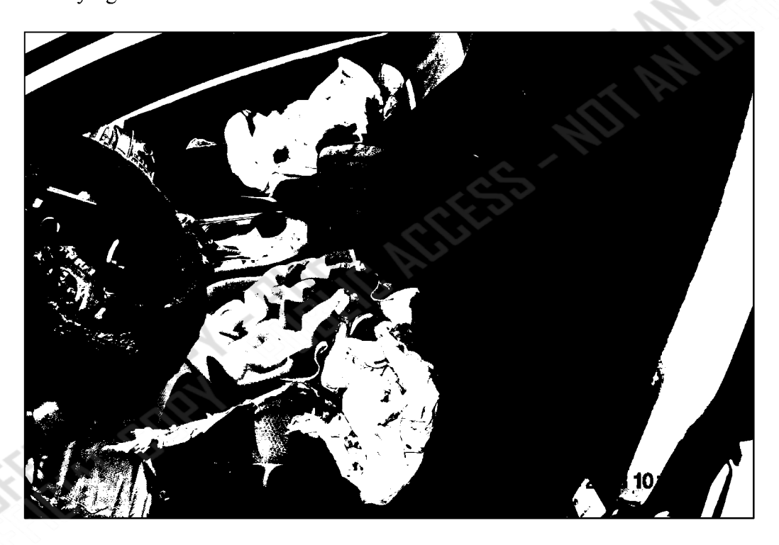
Exploded airbag module with shredded airbag on seat