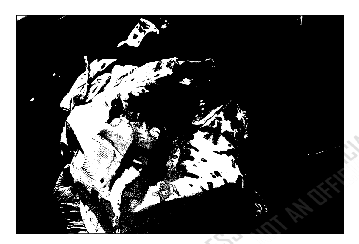
Shredded and blood-soaked front driver-side airbag