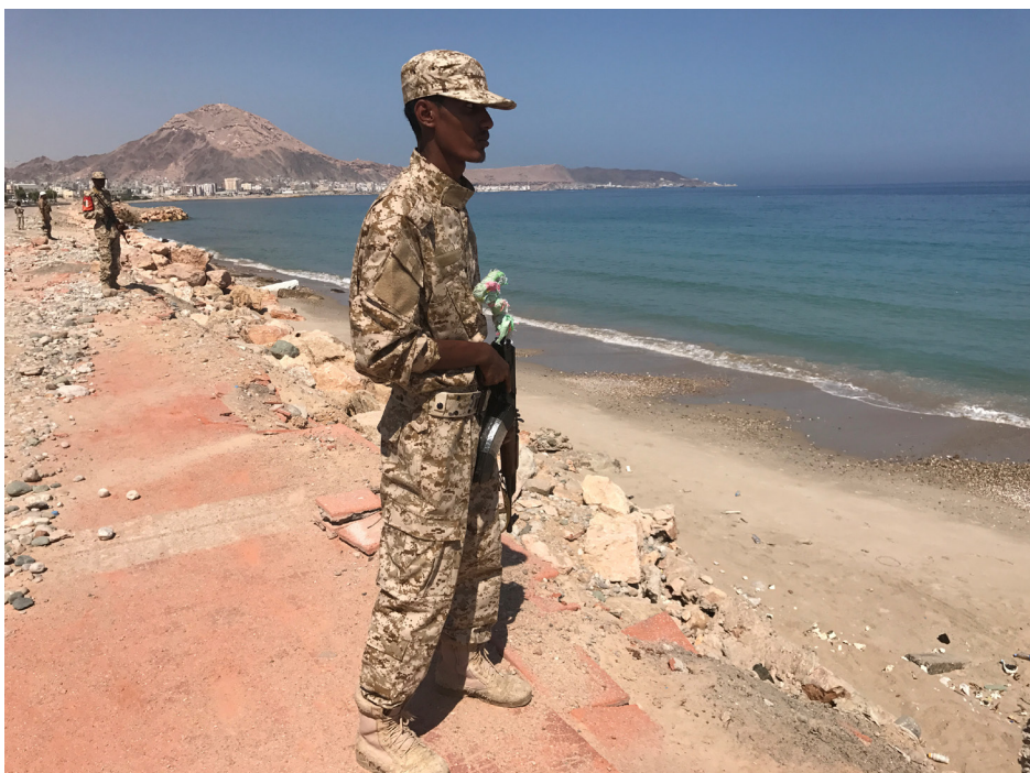
A Yemeni soldier stands guard on a beach in the city of Mukalla in southern Yemen April 22, 2017.

AQAP’s funding is highly contingent on its battlefield successes. If the group recaptures Mukalla or other major ports, or major oil infrastructure, it stands to benefit from a large, consistent revenue source. AQAP’s extensive war chest and deep roots of support across Yemen’s relatively ungoverned hinterlands provide an opportunity for the group to sustain itself and build local rapport for the foreseeable future. The group’s future territory gains will likely come under the auspices of a non-AQ organization to avoid international scrutiny and to broaden its popular support. The U.S. and its allies should expect a protracted, complex military campaign in Yemen to take place alongside peace talks pushing for a pluralistic government in Sanaa.