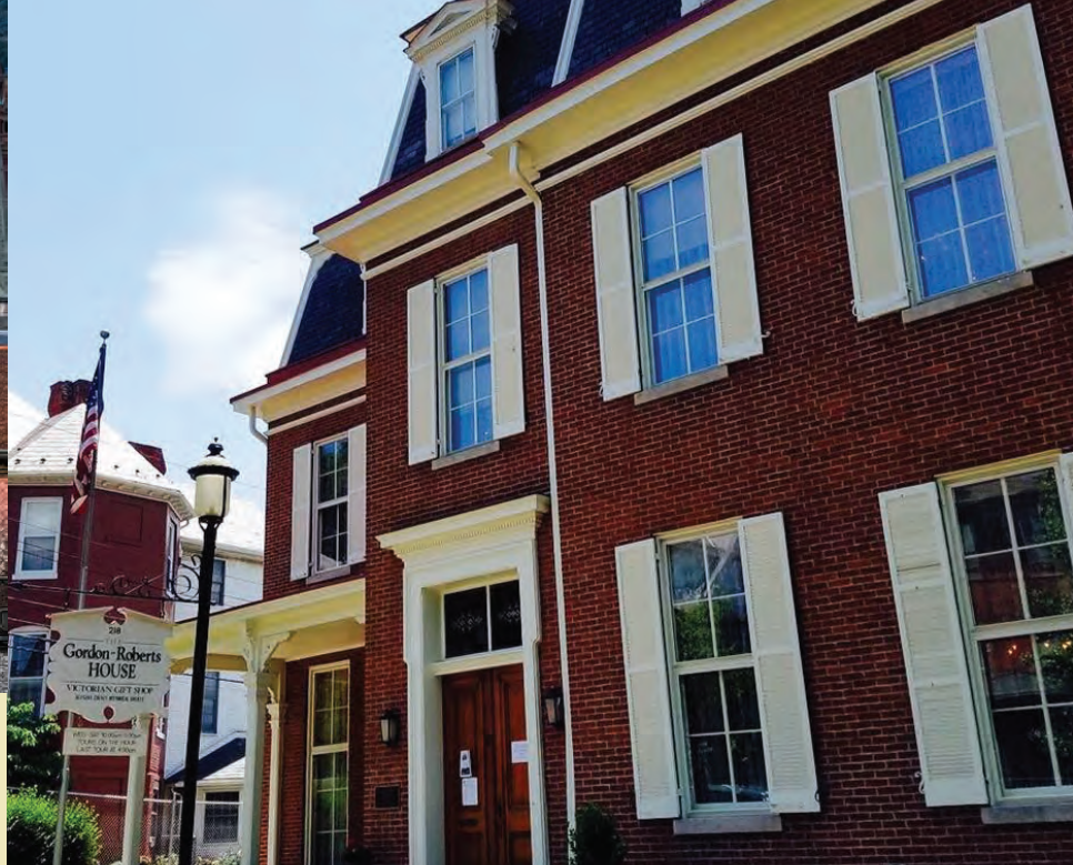
THE GORDON-ROBERTS HOUSE