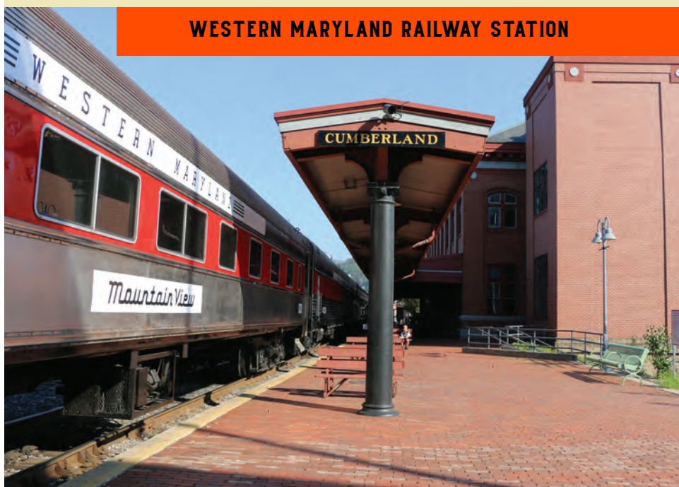
WESTERN MARYLAND RAILWAY STATION