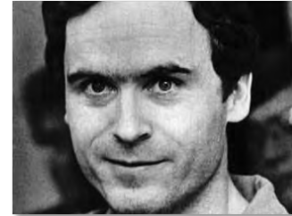
Ted Bundy- DNA uploaded in 2011