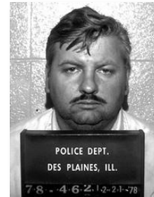
John Wayne Gacy-DNA uploaded in 2012