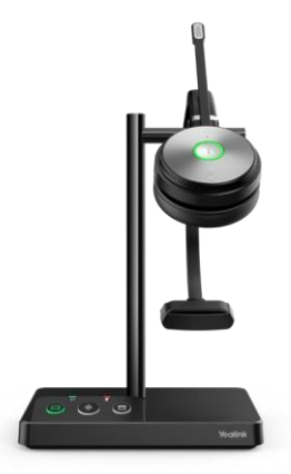
WH62 Mono Teams WH62 Mono UC