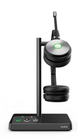
WH62 Dual Teams WH62 Dual UC

Based on hundreds of headform evaluations and thousands of wearing comfort tests, WH62 well meets the ergonomic requirements. Besides, with premier soft leather cushions and lightweight design, you can wear it all day comfortably. For more workspace freedom, WH62 can also free you up to 160m away from the desk.