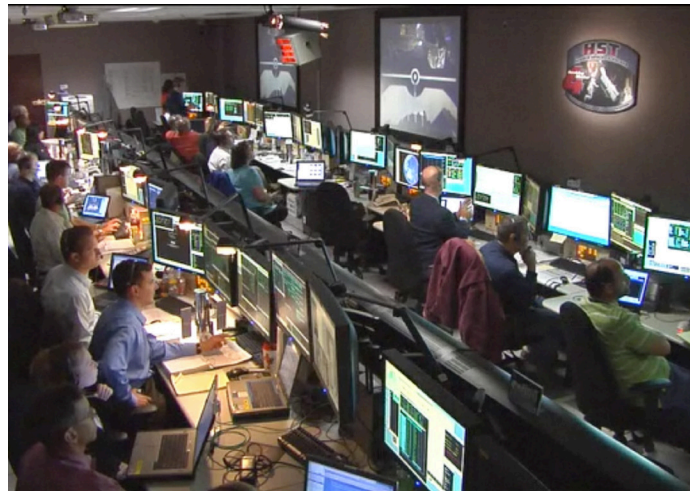
The Mission Operations Room during observatory commanding (left) and the Operations Support Room during Servicing Mission 4 (right)

These functions, which form Hubble's daily routine, are now performed autonomously, enabling STOCC personnel to focus on special operations and various tests. Since the advent of automated operations, the STOCC is staffed only eight hours a day, five days a week. If an anomaly occurs on the spacecraft or within the ground system when the facility is unoccupied, a high-reliability text-messaging system immediately alerts the appropriate members of the operations team.