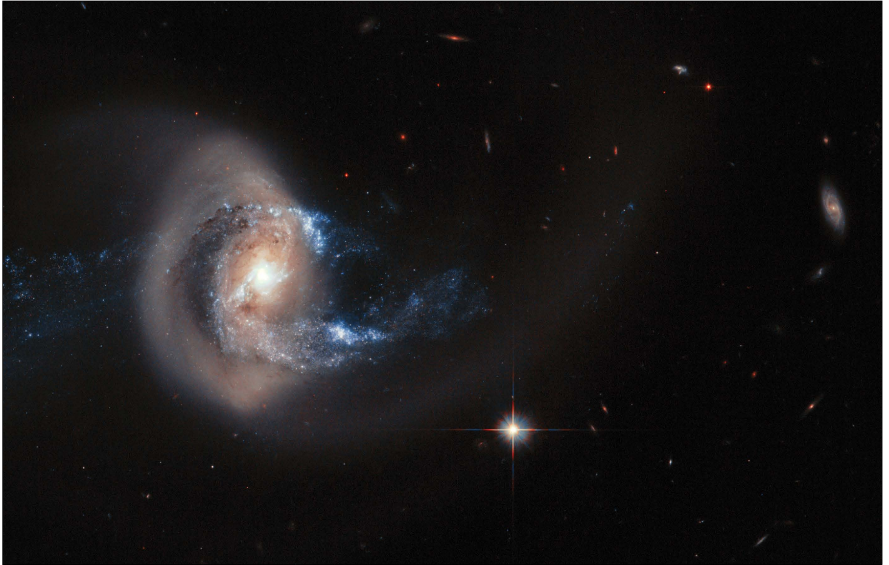
Interacting Galaxy NGC 7714