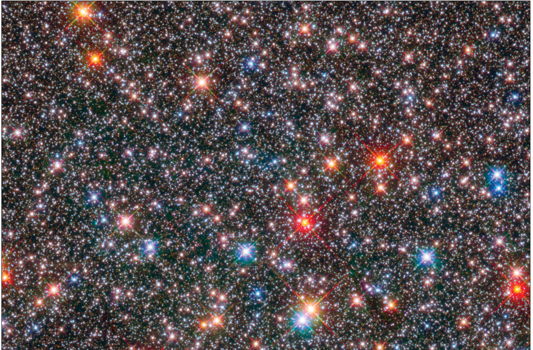
Heart of the Milky Way Galaxy