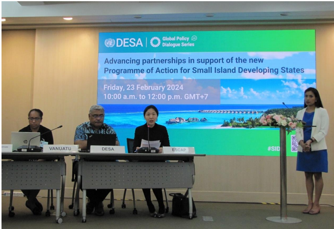
Delegates participate in the SIDS Partnership Symposium in Bangkok, Thailand, in February.