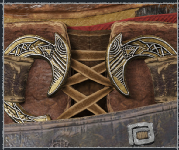
Beautifully hand-engraved bronze hook buckles

THANKS. ONCE I STARTED, COULDN'T STOP I'm proud of you, Brok, for embracing your inner Sindri here.