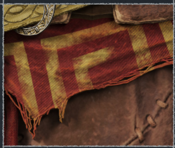
Bold splash of red, foreign fabric

THANKS. ONCE I STARTED, COULDN'T STOP I'm proud of you, Brok, for embracing your inner Sindri here.