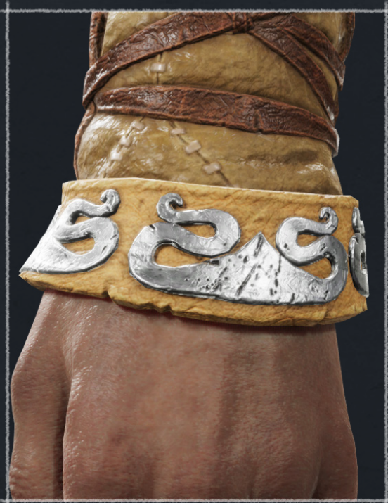
Burnished pewter cuff ornaments