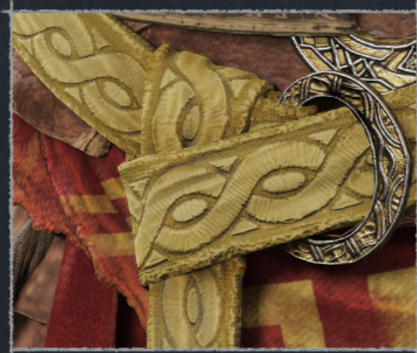
Sure do love the woven skirt!

So does he! He's worn it for as long as I've known him, in fact.