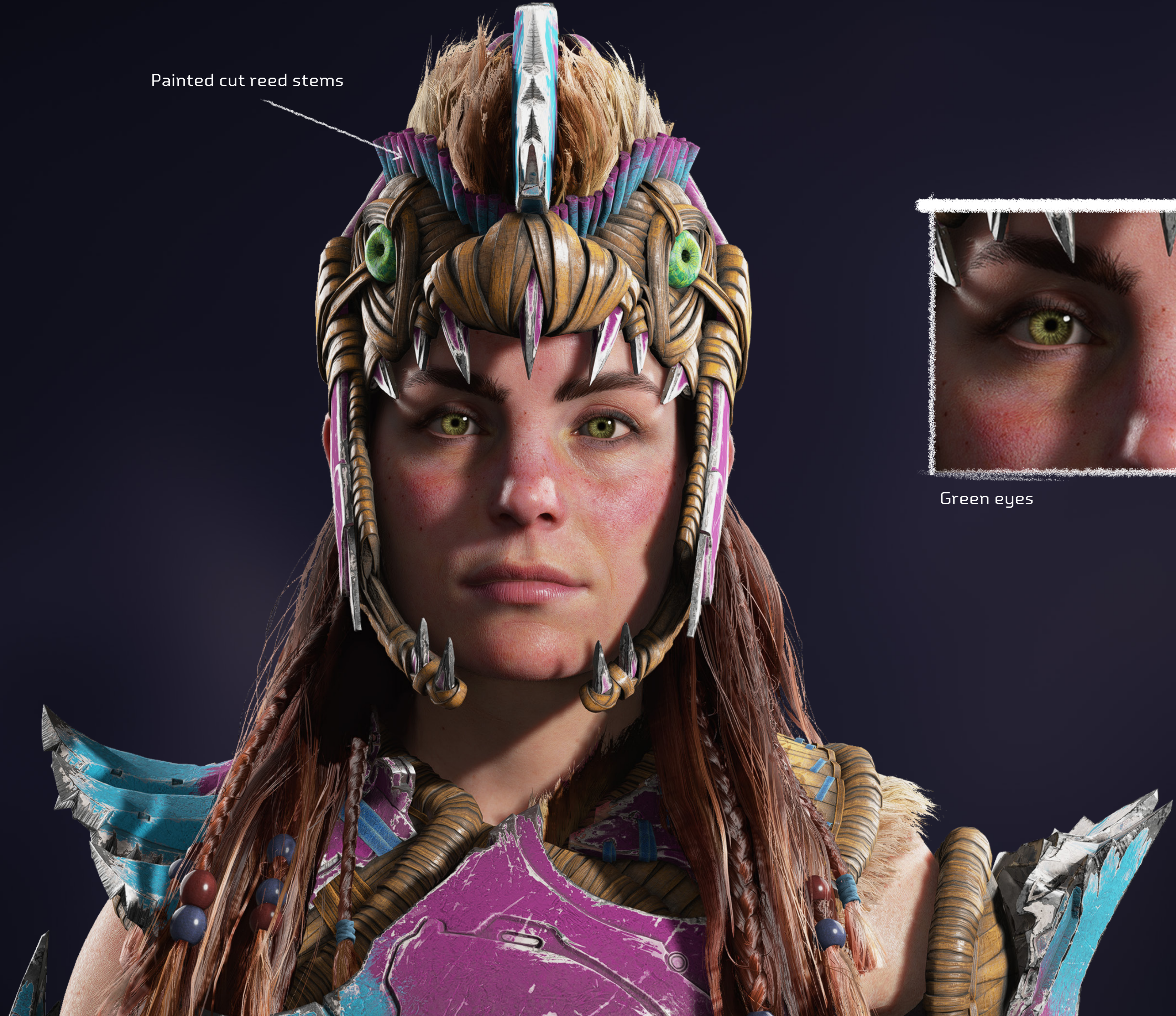
Painted cut reed stems

Aloy has freckles on her nose, cheeks and forehead. The only make-up she applies is a dark eyeliner.