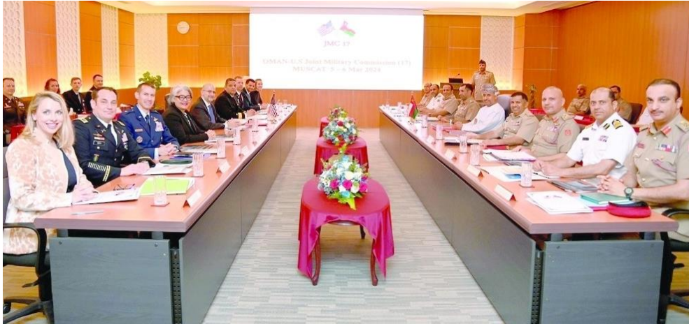
Figure 3. 2024 U.S.-Oman Joint Military Commission

threat deterrence, the Israel-Gaza war, Red Sea security, and how to strengthen the U.S.-Omani defense partnership. 61 Through the U.S. Department of Defense's National Guard Bureau State Partnership Program, the Arizona National Guard has partnered with the Sultan of Oman's Armed Forces, beginning in 2022.