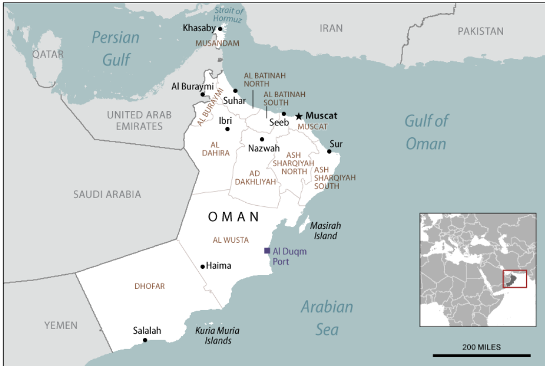
Figure 1. Oman

The Sultanate has used its limited oil-generated wealth to provide citizens with subsidized goods, low taxes, and public sector salaries. During periods of lower oil prices, these costs can strain Oman’s national budget. Nonetheless, Oman has made progress in reducing its debt to Gross Domestic Product (GDP) ratio, which remains high by GCC standards. Public debt was estimated to be around 35% of GDP in 2023, down from 64% of GDP in 2020; total debt is $39.5 billion. 6 In September 2023, global credit rating agency Fitch Ratings upgraded Oman’s credit rating to BB+ from BB due to the decline in Oman’s debt-to-GDP ratio. Since 2022, pressure on the treasury has somewhat eased due to higher oil prices and government repayment of sovereign debt, though the fundamental challenge of how Oman transitions to a post-oil, private-sector led economy remains. 7