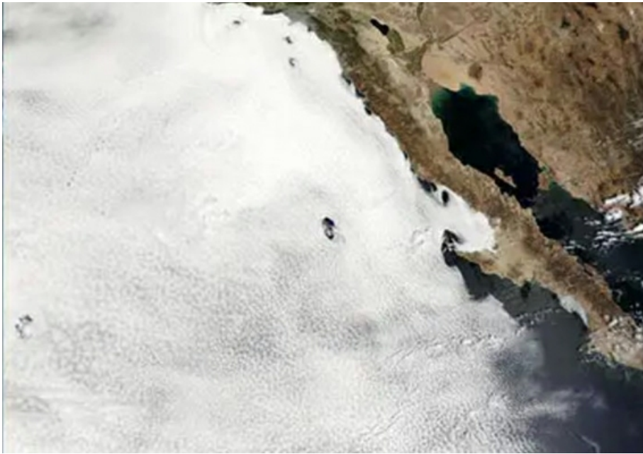
Fig. 1: visible satellite image of part of an extensive marine stratocumulus deck off the western seaboard of North America, with Baja California easily recognisable on the right.

With their highly reflective tops that block a lot of the incoming sunlight, the marine stratocumulus clouds have a very important role as climate regulators. It has long been known that increasing the area of the oceans covered by such clouds, even by just a few percent, can lead to substantial global cooling. Conversely, decreasing the area they cover can lead to substantial global warming.