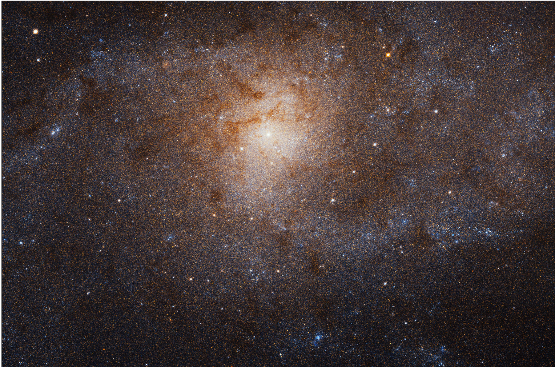
Triangulum Galaxy (M33)