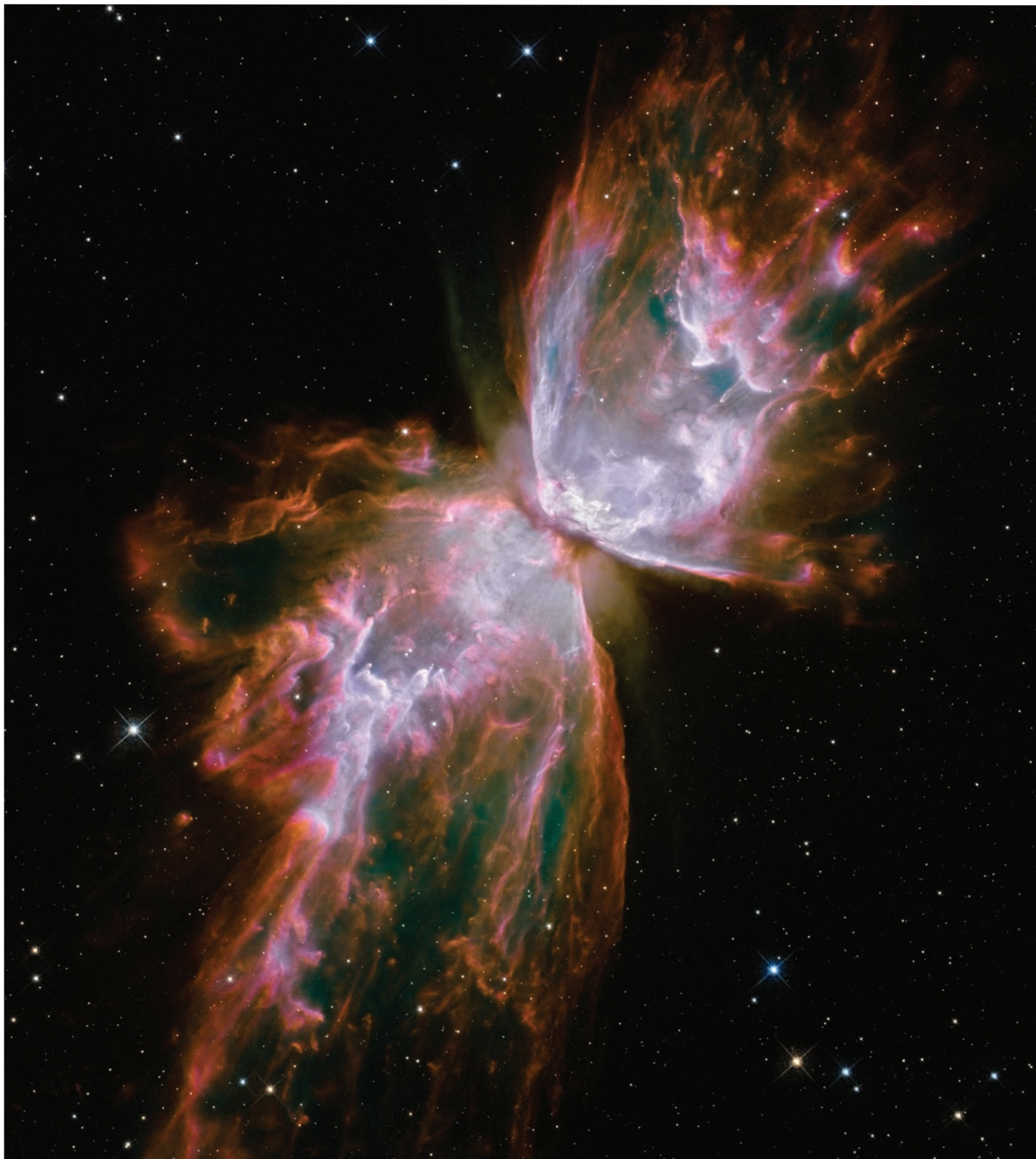
The Butterfly Nebula (NGC 6302)