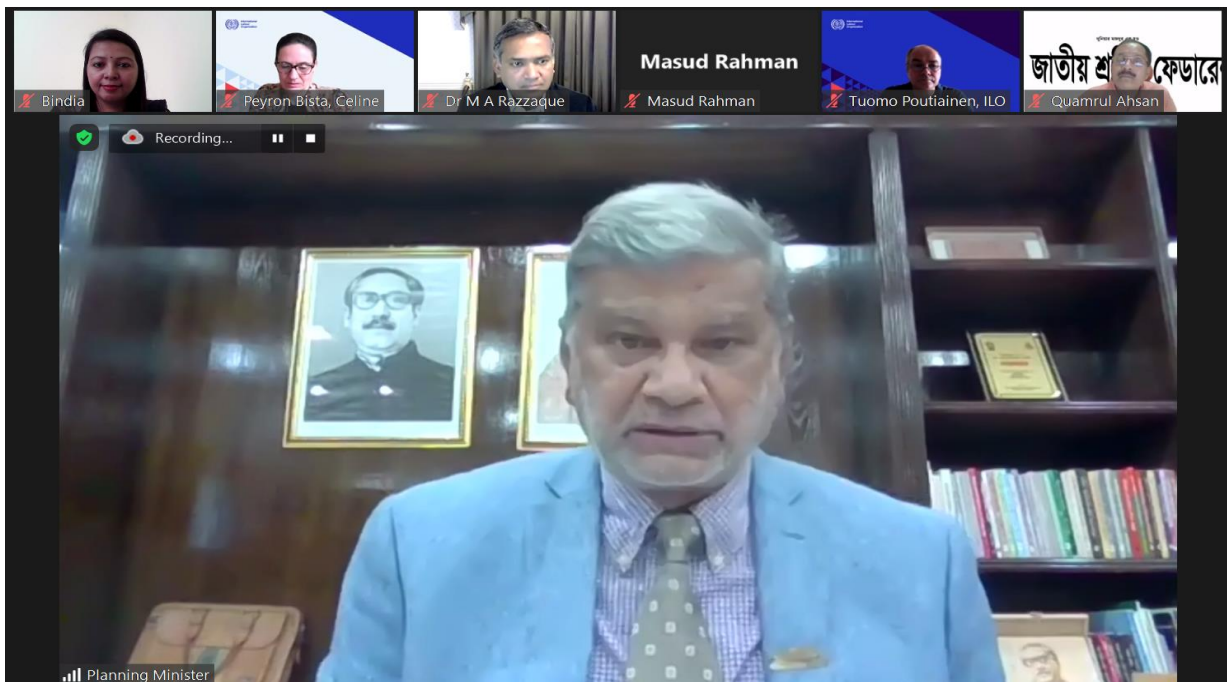
Chief Guest Hon'ble Minister, M.A. Mannan, MP, Ministry of Planning, GoB delivering his speech

But he assumes that some distortions are made by people. There are many groups in a try to distort the market force avoiding our eyes to gain the political benefits, so that rent seeking situation arise. Therefore, many people fall in disadvantage situation and unemployed despite having a scope to work. He requested all to look into this. He expressed his view from his limited experience on demographic dividend that this is not very easy to achieve since there are many pitfalls in it. But as a whole, there is a high possibility in our country to have these benefits like other countries those have experienced such benefits. If we look 200 to 300 years back then this kind of dividend perhaps held but nobody could realize then since there was no scientific explanation, he said. He mentioned that many countries have had the opportunity to grasp other's wealth and transfer to own country that Bangladesh does not have. So, we have to look for the opportunities in economics and take our large population on a positive note.