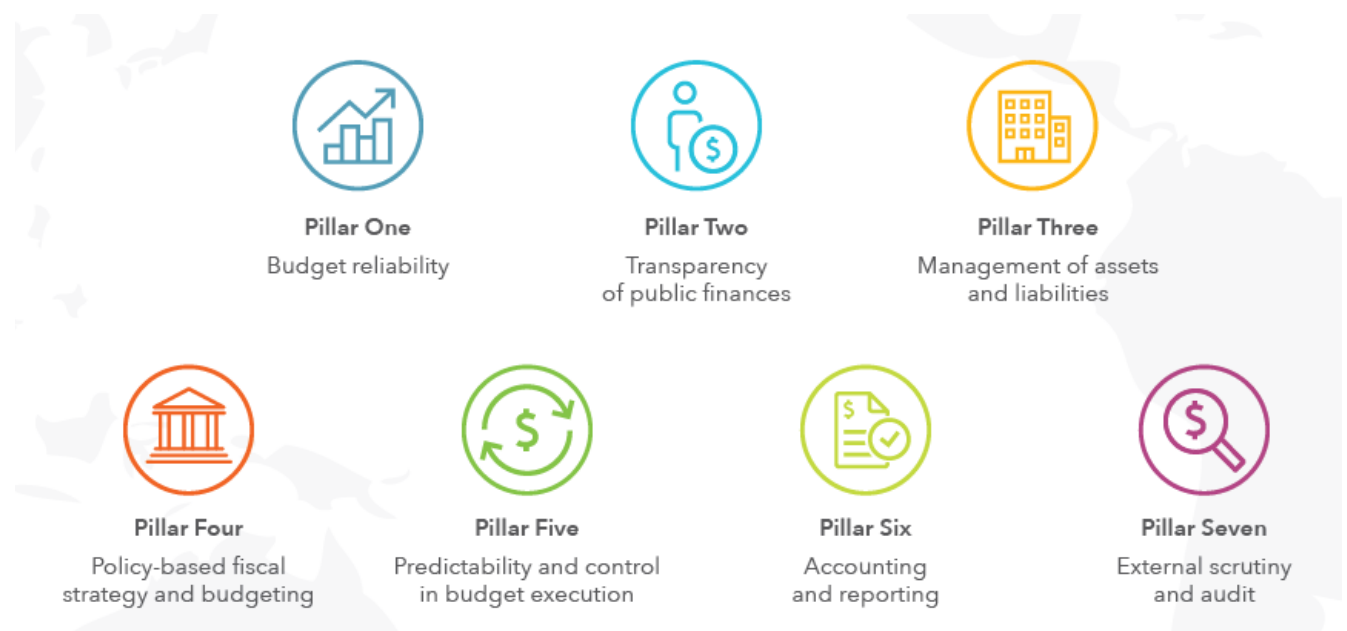
Figure 2 The Seven Pillars of the PEFA Framework