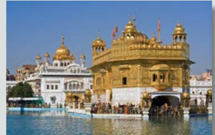
The Golden Temple, or Harmandir Sahib, in Amritsar, Punjab, northwestern India.