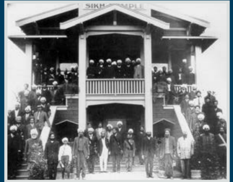
The Gurdwara at Stockton in 1929

southasia.berkeley.edu Tel: 510-642-3608 Fax: 510-643-5793