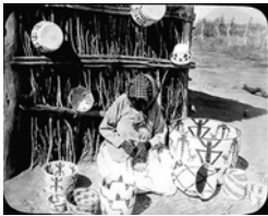
Traditional Basketmaker, ca 1918