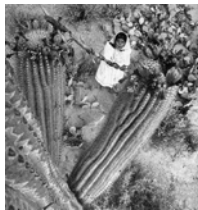
Picking Sahuaro Fruit