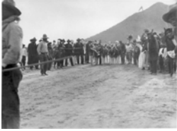
Old Running Game