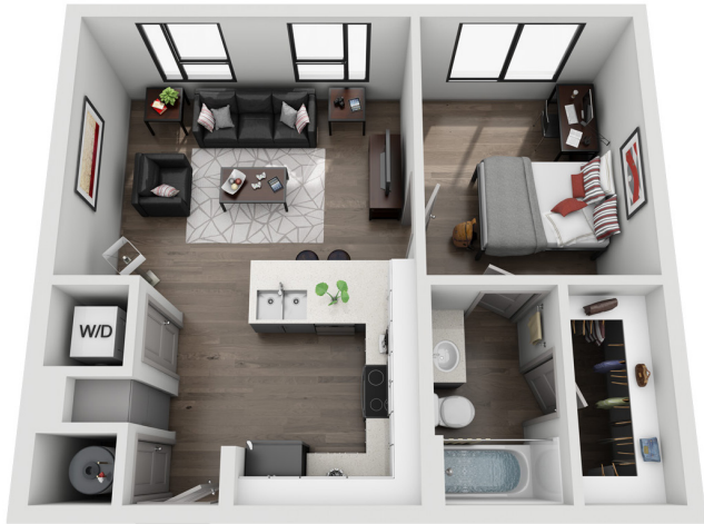
ONE BEDROOM EXAMPLE