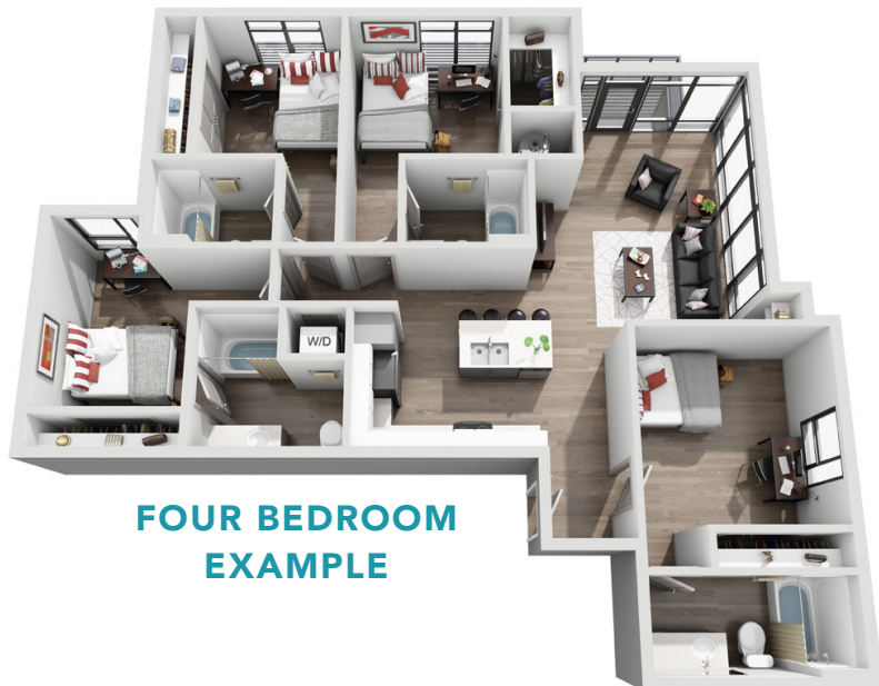
FOUR BEDROOM EXAMPLE