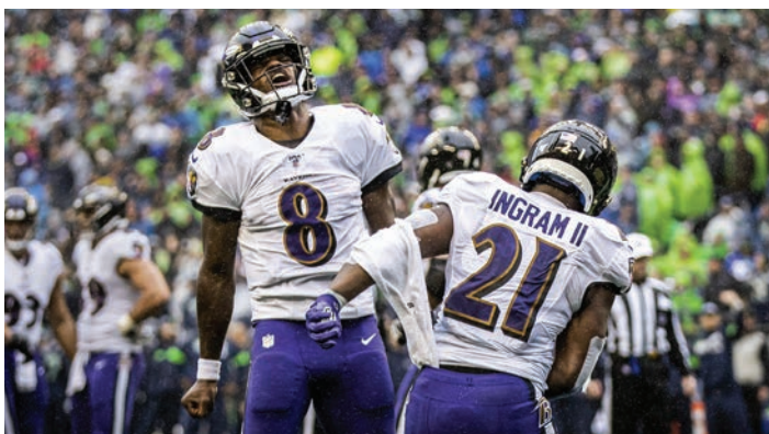
In 2019, led by QB Lamar Jackson and RB Mark Ingram II, the Ravens set a new NFL single-season rushing record (3,296 yards), besting the 1978 Patriots' 3,165.

3/16 - Ravens employees at the team's Owings Mills training facility (the Under Armour Performance Center) and M&T Bank Stadium began working from home in the midst of the COVID-19 global pandemic...For several months, extending into late June and early July, nearly all team operations were