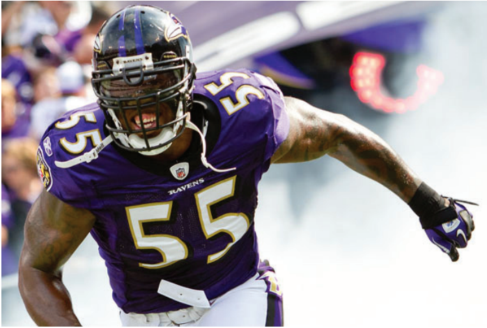
OLB Terrell Suggs was named the 2011 AP NFL Defensive Player of the Year.

Baltimore Ravens (1996-2003), Modell directed teams that produced 28 winning seasons, 28 playoff games, two NFL Championships (1964 and 2000), three other appearances in NFL title contests (1965, '68 and '69) and four visits (1986, '87, '89 and 2000) to AFC championships.