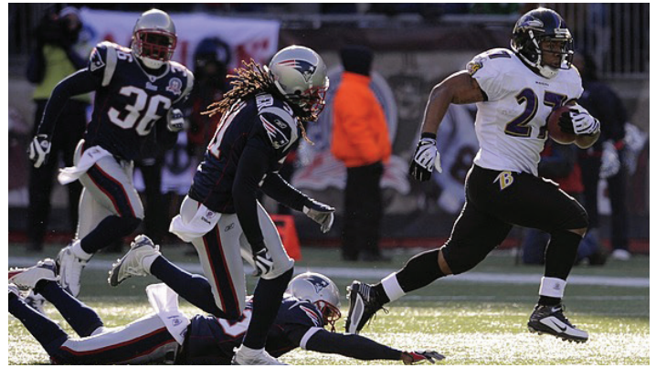
RB Ray Rice bolted for an 83-yard TD run on the first play from scrimmage in the Ravens' Wild Card win over New England during the 2009 playoffs.

1/9 - In the Wild Card game at Kansas City, the Ravens prevailed 30-7, becoming the only NFL team to win at least