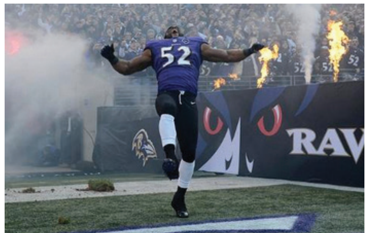
For the final time in his legendary career, LB Ray Lewis performed his famous intro dance at M&T Bank Stadium before the 2012 Wild Card win vs. the Colts.

2/3 - For the first time in any of the four major pro sports, two head-coaching brothers (John and Jim Harbaugh) faced each other in a championship game. After taking an early 28-6 lead, the Baltimore Ravens needed a goal-line stand to clinch their second World Championship, defeating the San Francisco 49ers, 34-31, in Super Bowl XLVII in New Orleans, LA, at the