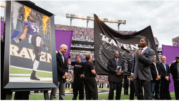
Ray Lewis (above) was inducted into the Ravens' Ring of Honor (detailed on previous page) in 2013, following his incredible 17-year NFL career.