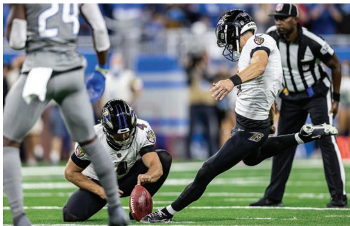
K Justin Tucker booted an NFL-record 66-yard FG to help Baltimore beat Detroit.

9/12 - K Justin Tucker converted a 66-yard game-winning FG as time expired at Detroit, giving Baltimore a 19-17 victory... Tucker surpassed K Matt Prater's 64-yarder in 2013 as the longest FG made in NFL history.