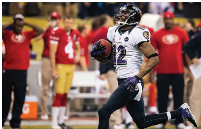
WR/RS Jacoby Jones posted a 108-yard KOR-TD to open the second half of Super Bowl XLVII. Jones also added a 56-yard TD catch during the game, helping set a Super Bowl single-game record for most combined yards (290).

6/5 - As guests of President Barack Obama, the Ravens visited The White House and were honored for winning Super Bowl XLVII. Said the President: "Now, I imagine there were times last year when these players were the only ones who knew that they'd make it here to show off this trophy. Because, during the year, they lost player after player to injury; they