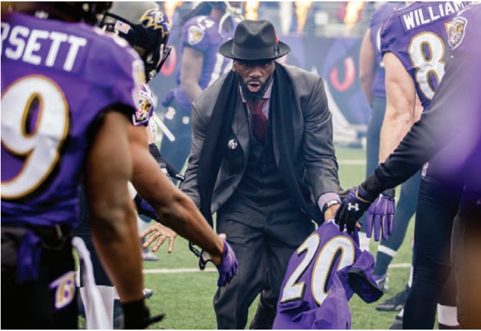
Legendary safety Ed Reed, who ranks first in NFL history with 1,590 INT return yards, was inducted into the Ravens Ring of Honor in 2015.