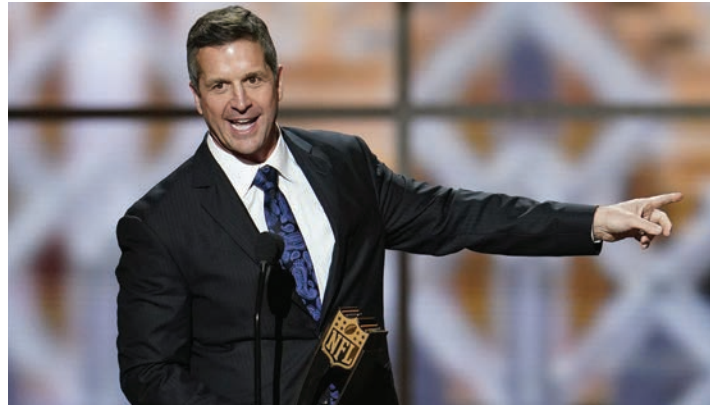
John Harbaugh became the first Ravens coach to take home AP NFL Coach of the Year honors following the 2019 season.

Baltimore allowed the NFL's third-fewest points (17.6) and fourth-fewest net yards (300.6) per game. The Ravens notched the league's No. 5 run "D" (93.4 ypg) and were No. 6