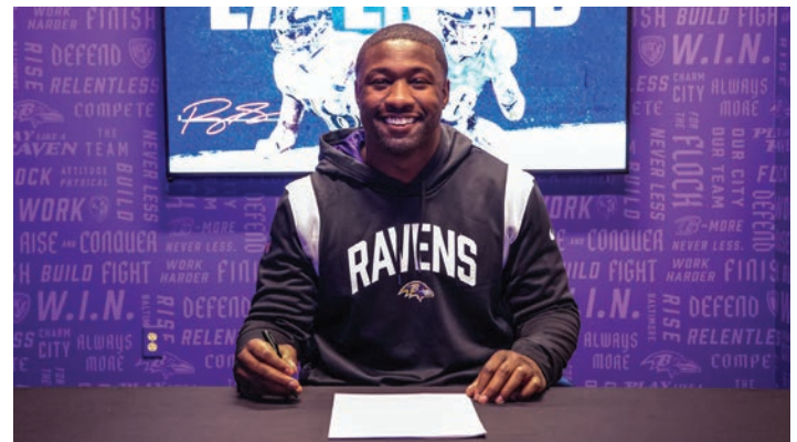
Roquan Smith (above) earned his first-career Pro Bowl nod and was named first-team All-Pro after being acquired by Baltimore in a 2022 mid-season trade.

1/11 - The Ravens signed ILB Roquan Smith to a contract extension, agreeing to a five-year deal with the star linebacker who arrived in a 2022 mid-season trade from Chicago.