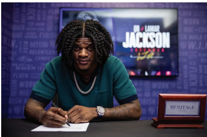
Lamar Jackson (above), the 2019 unanimous MVP, is one of six QBs in NFL history to notch at least 10,000 passing yards and 4,000 rushing yards in a career.