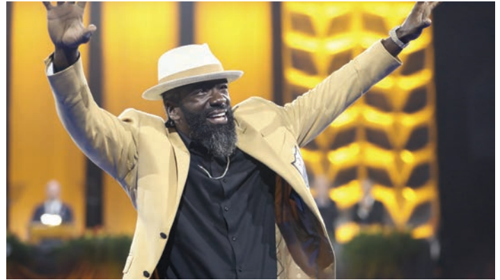
S Ed Reed became the third "homegrown" Raven (T Jonathan Ogden - 2013 & LB Ray Lewis - 2018) to be inducted into the Pro Football Hall of Fame.

2/2 - In a ceremony held in Atlanta the night before Super Bowl LIII, Ed Reed, a nine-time Pro Bowler and the Ravens' all-time leader in INTs (61), was announced as a 2019 Pro Football Hall of Fame inductee.