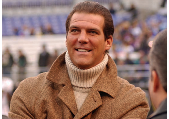
The NFL approved new owner Steve Bisciotti's purchase of the Baltimore Ravens in April 2004.

4/13 - The Ravens and McDaniel College extended their partnership six years to keep training camp in Westminster. The deal included installation of Sportexe Momentum Turf on the college's main athletic field, with both parties sharing costs.