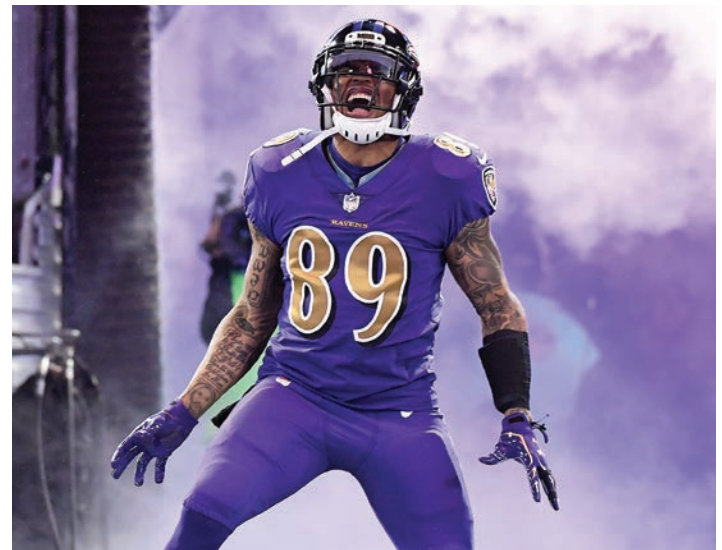
WR Steve Smith Sr. seen above in the Ravens' all-purple "Color Rush" uniforms for the 11/10/16 game vs. Cleveland, which the Ravens won, 28-7.

11/20 - With 93,056 fans watching at Dallas' AT&T Stadium, the Ravens played in front of the largest crowd in their franchise's history...The Cowboys emerged victorious, however, 27-17.