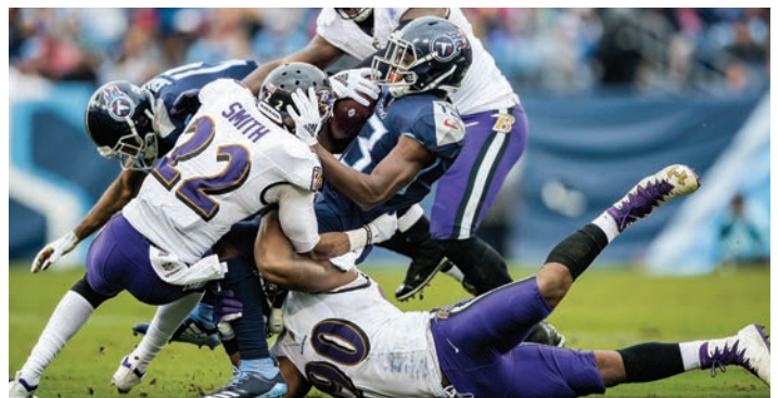
Baltimore produced a franchise-record 11 sacks during a 21-0 shutout of the Titans in Tennessee (Oct. 14).