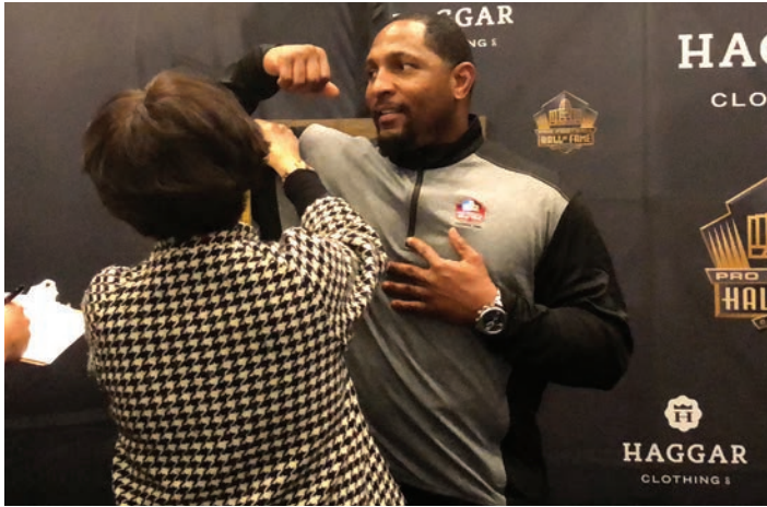
The night before Super Bowl LII, it was announced that LB Ray Lewis would be inducted into the Pro Football Hall of Fame Class of 2018. In the picture above, Lewis is fitted for his HOF gold jacket.